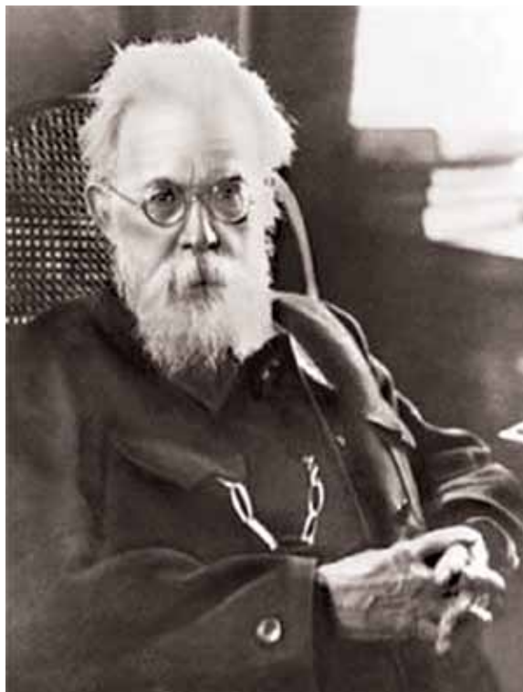
"V.I. Vernadsky's fundamental discoveries in physical science live in the very foundations of the actual meaning of the human mind."

Such considerations engage a profound principle of our universe (at least for as much as scientists generally know as both the Solar system and defeating the hazards of the journeys through the tracks of the Galaxy which contains it). V.I. Vernadsky's virtually miraculous mind, touches upon such higher ranges of matters located within particularly important celestial pro-