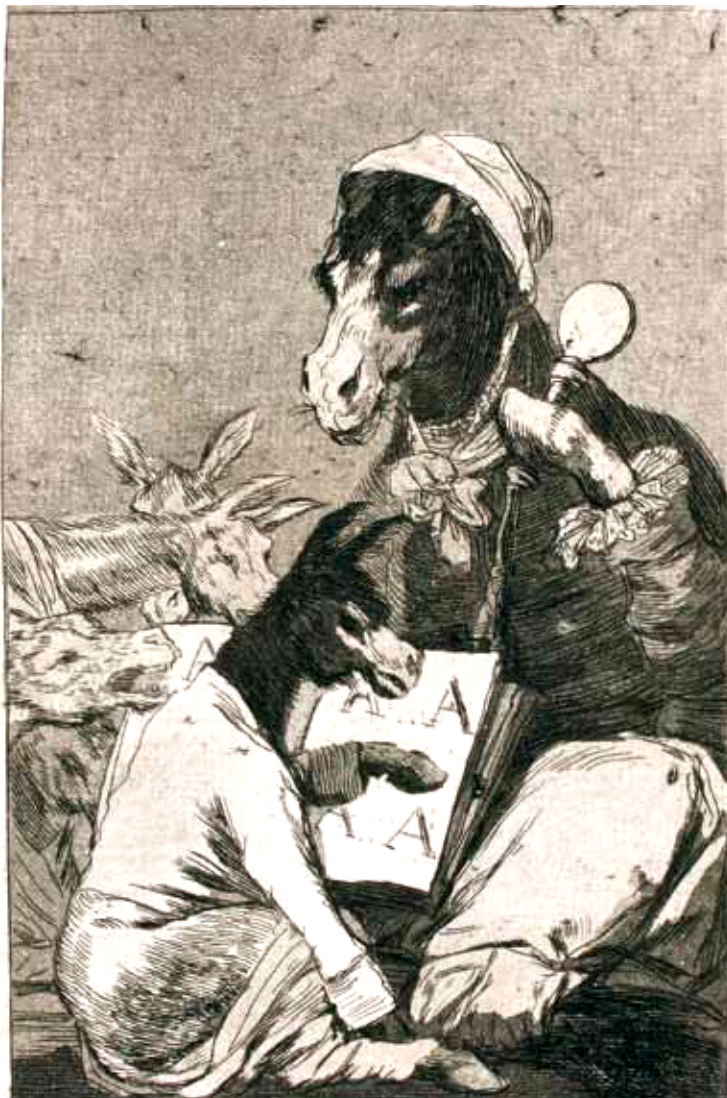
Capricho 37: “Might not the pupil know more?” Francisco de Goya (1797-98).

John F. Kennedy and General Douglas MacArthur had forewarned, prior to the assassination of John F. Kennedy, and as during the closely following death of our republic’s then greatest living military strategist, Douglas MacArthur.