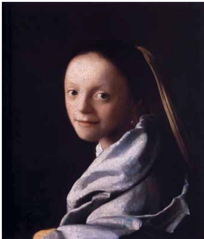
The creative spark in every human individual is what differentiated him or her from the beasts; it is this on which the progress of mankind depends. Shown is Johannes Vermeer's "Portrait of a Young Woman" (1665-67).

The emphasis is to be placed on discoveries which, in one sense, or degree, had not been presented to human authors of original creative performances, ear-