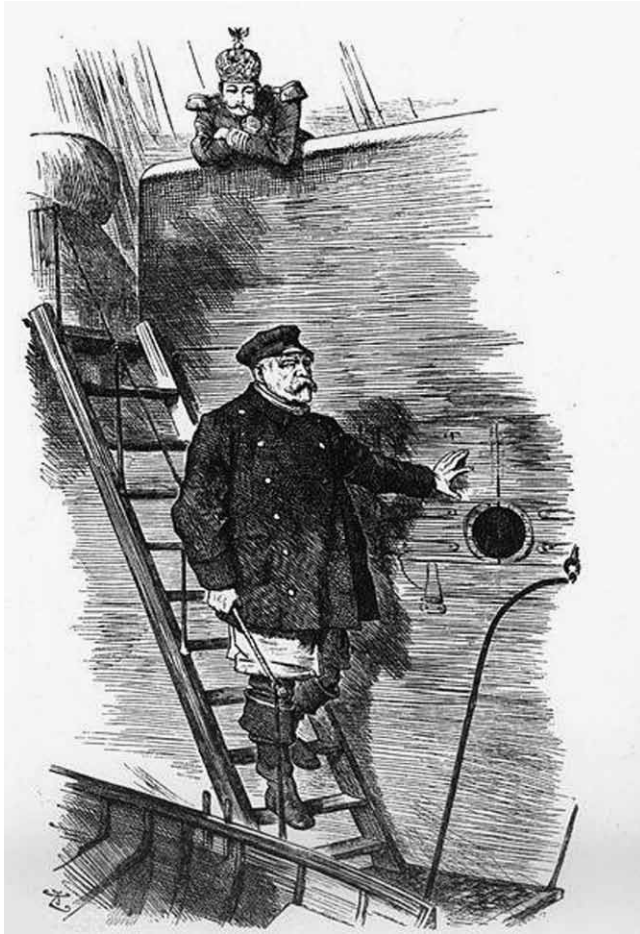
"Dropping the Pilot," by Sir John Tenniel, Punch, March 1890. Chancellor Otto von Bismarck leaves the ship of state, as the foolish Kaiser Wilhelm II looks on. American citizens, LaRouche writes, "tend to be even sillier than the German aristocracy of those past times of the onset of the 'great war'...."

The crucial point which these facts emphasize, is, that the present level of means of global warfare now lies within a merely brief moment of the application of means of warfare—even extinction warfare—which is now not only possible, but highly probable, and that urgently to be considered so.