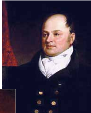
Alexander Hamilton (below): the founder of the original economic policy of the United States; the bold and masterly James Monroe (left); and John Quincy Adams, the organizer of the system of economy of the Federal states.