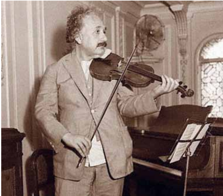
The innate potential of the human mind is expressed in the manner illustrated by the principles of musical composition and performance associated with the achievements of the like of Johann Sebastian Bach, principles which apply equally to the field of physical science. One sterling example of this confluence is Albert Einstein, shown here playing his violin in January 1931.