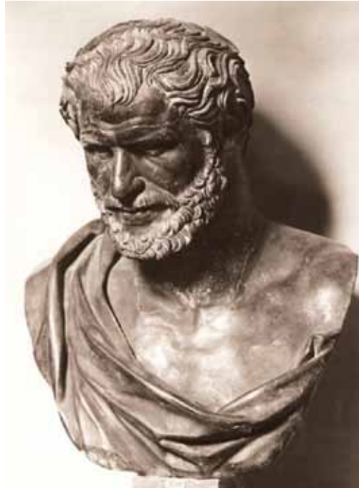
True universal principles can never be known or deduced from sense perception, LaRouche argues. The tradition of such knowledge goes back to early Greek philosophers, such as Heraclitus (right) and Plato (left).

ior in any degree of actually ontological depth, have usually halted at the limits of the joint discovery of a generally outlined principle of the human mind which had been shared by Wolfgang Köhler and Max Planck. The latter pair of scientists have not erred in respect to what they have proposed in this matter; but, that discovery of theirs has not yet been carried forward deeply and broadly enough to uncover and correct the stubbornly remaining, systemic fallacies inherent in the current use of sense-perceptual experience, as such. The effect is such, that a correction is urgently needed, that if we are to become able to capture a sense of the principle which is to be considered here as a true authority of the now urgently needed quality for the present global and broader crises of mankind presently.