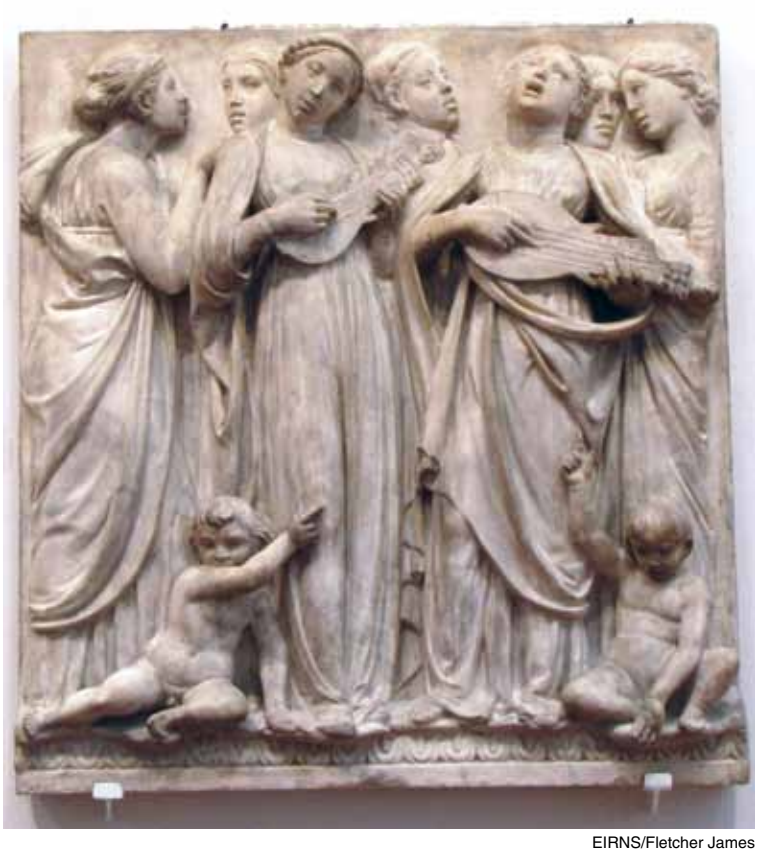
"The problem is, essentially, that the sense of a future depends upon recognizing the authority of what has not yet been experienced." Reality exists beyond sense-perception as such, as in Classical musical composition. Shown: a detail from the Cantoria relief sculptures, by Luca della Robbia, Santa Maria del Fiore (1431-38).

In the immediately preceding chapter of this present argument, I have emphasized that the actual location of the power of human reason is located independently of mathematical calculation as such. The power is located