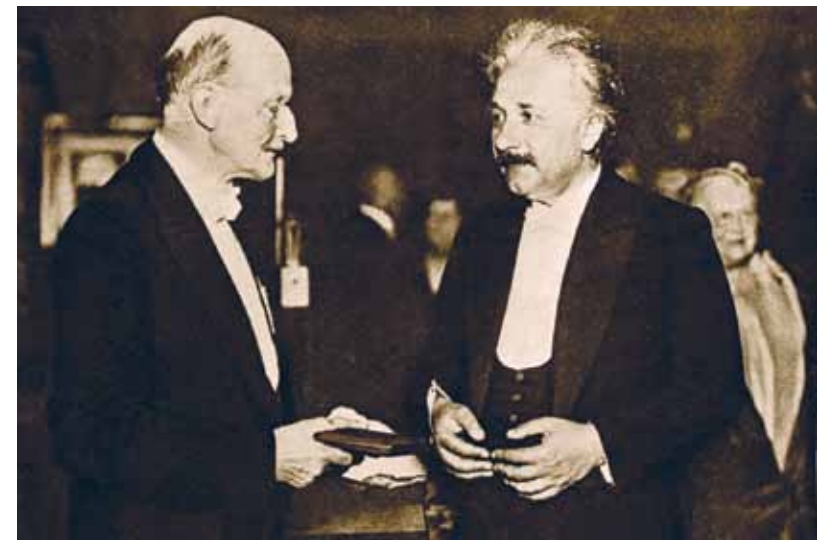
It is "the force of passion, called creativity, which drives the human being, from the inside, into great achievements of science and Classical artistic composition." The musicians and scientists Planck and Einstein (shown here in Berlin, June 1929) express this quality.

pollute and dominate the planet's internal relationships since that time, up through the present date.