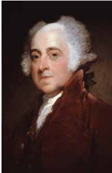
“The great folly” which ruined the “beautiful achievement of our original U.S. Federal Constitution, was, to a large degree, an outcome of the elections of the misguided John Adams and Thomas Jefferson as Presidents of the United States,” writes LaRouche. Portrait of Jefferson (left) by Rembrandt Peale (1800); Adams, by Asher B. Durand (1835).

process of extinction of the human species.