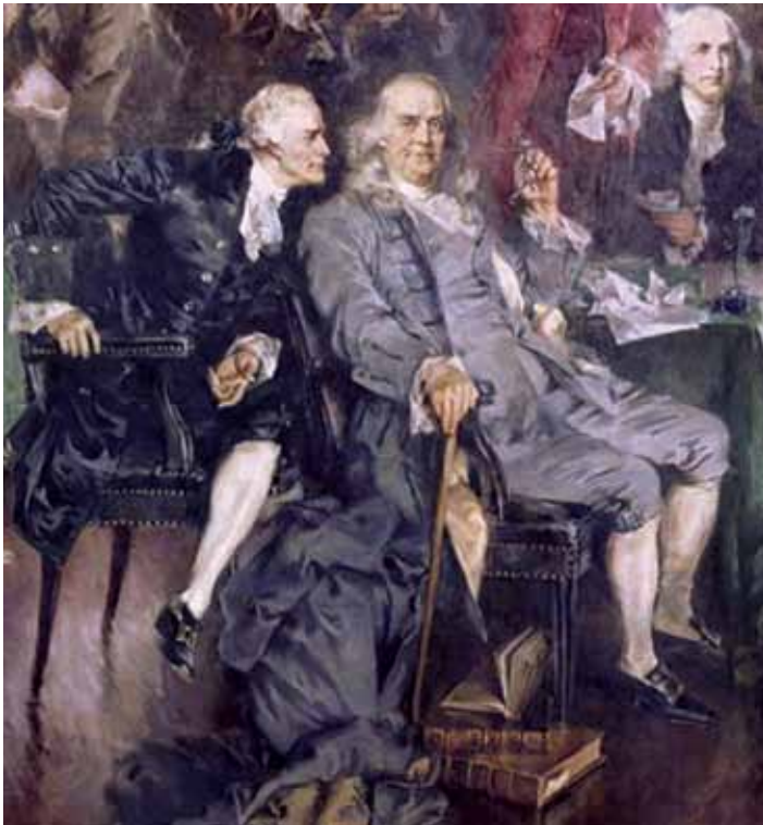
"The notion of money must be now replaced, in its entirety, by the same principle of credit which was introduced to the U.S. Federal Constitution by the prompting of Benjamin Franklin and Treasury Secretary Alexander Hamilton." Detail of "The Signing of the U.S. Constitution," by Howard Chandler Christy (1940); Hamilton looks over Franklin's shoulder.

his De Docta Ignorantia distinguishes the principle upon which the founding of a competent modern science rests, from its then continued Mediterranean-based Roman and medieval predecessors.