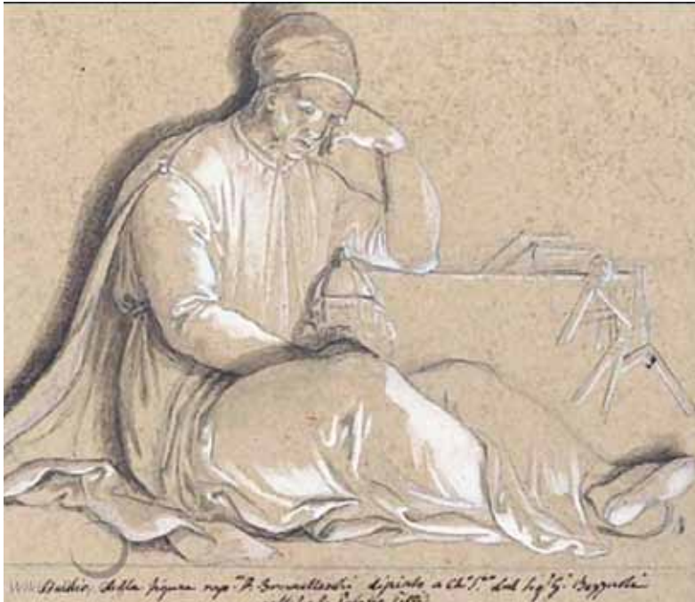
The 15th-Century works of Nicholas of Cusa and his follower Filippo Brunelleschi profoundly influenced the founders of the American Republic, notably its scientific genius Benjamin Franklin. Shown: Brunelleschi, holding a model of his creation, the Dome of Florence Cathedral (by Giuseppe Bezzuoli, early 19th Century).

Law precedents. That is, indeed, “The Oligarchical Principle.”