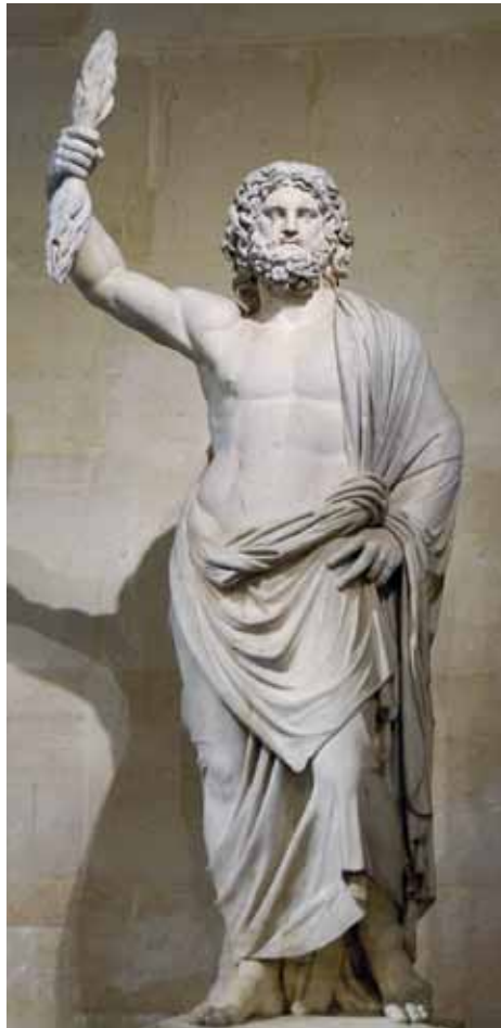
The oligarchical principle is premised on the supremacy of class of persons regarded as virtual "gods," "akin to such as the esteemed rulers of Wall Street and London presently." The rest of us are treated as mere cattle, to be reared, harvested, or simply killed. Shown: Zeus, ruler of the Olympian "gods" (Roman, mid-Second Century A.D.; restored, 1686).

This system, which is known to the cultures of Mediterranean-centered societies as a system of (actually) oligarchical law, limits the authority to define the meaning of "law" to what is, ultimately, a single human-like figure, or some other image, such as an insane U.S. President Barack Obama, who insists after the same