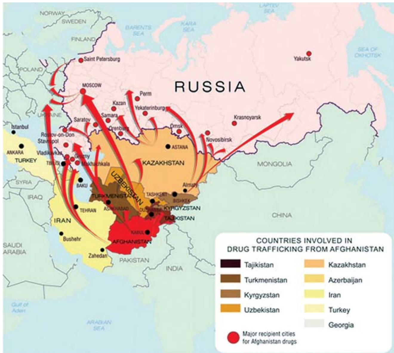
FIGURE 1 Main Routes of Heroin Trafficking from Afghanistan to Russia

Institute for Demography, Migration and Regional Development