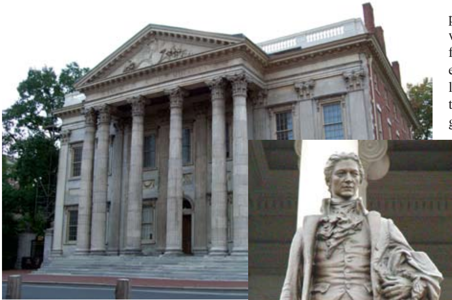
Alexander Hamilton, the first U.S. Treasury Secretary, established the National Bank in Philadelphia, shown here. "Such a bank," he wrote, "is not a mere matter of private property, but a political machine of the greatest importance to the State."

The pathological element which binds together victims such as the G-8 or G-20 as slaves of a London-centered, international monetarist tyranny today, is the prevalent, mistaken belief that money as such is a standard measure of economic value. That is a delusion