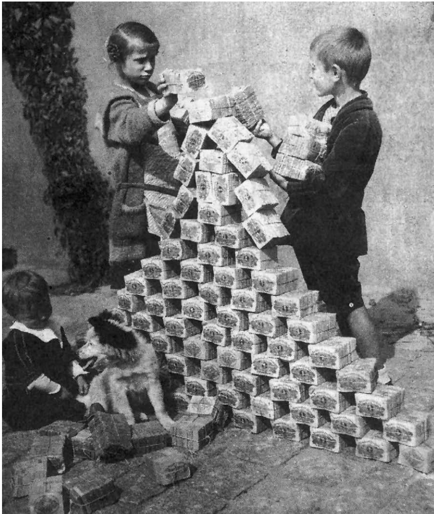
We are now on the verge of a shift, LaRouche warns, "to an overtly, explosive hyperinflationary movement in prices not dissimilar to that in Weimar Germany of Spring-November 1923." Here, children in Weimar Germany use worthless stacks of paper money as building blocks.

September 2007, have successfully sent the real economy of both nations careening to the bottom at generally accelerating rates of increased unemployment and business closures. So, the rate of the inflationary spiral soars under the Obama Administration's key controller, Larry Summers, while the wages of domestic productive labor and essential industries and agriculture collapse.