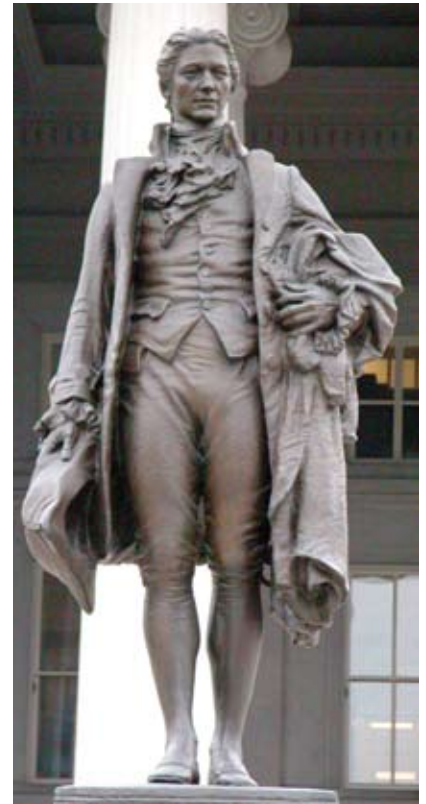
What Paulson doesn't understand: the physical-economic principles established by the universal genius Leibniz (left), and followed by America's first Secretary of the Treasury, Alexander Hamilton (right).

Hamilton. Hamilton largely followed the guidelines of physical-economic principle which had been established by the great universal genius Gottfried Leibniz.