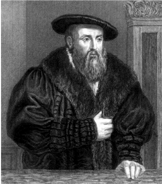
It was Kepler, and not the fraudster Newton, who made the uniquely original discovery of a universal physical principle of gravitation.

have no systematic involvement emotionally. For them, like Sophists generally, what they wish to be caught believing, praising, or deprecating, is the extent of their emotional engagement in the subject on which they express their “hand-waving” opinions. Like all Sophists, for them, truth is not the issue; being “accepted” by whatever circles by whom one wishes to be accepted, is everything. “MySpace mass-psychosis” is only an extreme expression of that misuse of emotions intended to evade the realities of either physical science, or almost anything else real in life’s experience.