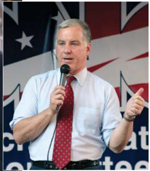
Under the reign of Barack Obama- and Howard Dean-funder George Soros, the privileged get the dollars; the others get the "change." Left to right: Soros, Obama, Dean.

during the Spring 1968 developments and beyond. It was not injustice to them which provoked them; what I witnessed was the "existential" fear prompted among those who regarded themselves as representing a privileged idle class, in their flight from their real, existential fear of actually being dumped into the same pot with the types of the combined, "blue collar" industrial and farmer majority whom they came, more and more, to hate.