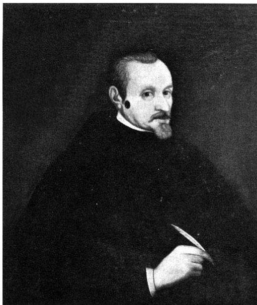
The new form of empire which emerged from the leadership of Venice’s Paolo Sarpi (above) spawned today’s Anglo-Dutch Liberal system, and unleashed the swarm of financiers at its core; the imperialist speculators in today’s petroleum “spot market” are the direct heirs of Sarpi’s model.

However, do not forget, that the actual happiness of the British Isles’ “normal people” was not a pleasing prospect for a royal financier oligarchy in the tradition of Venice’s Paolo Sarpi and his northern European maritime region’s ambitious followers of Sarpi’s “New Venice” policy.