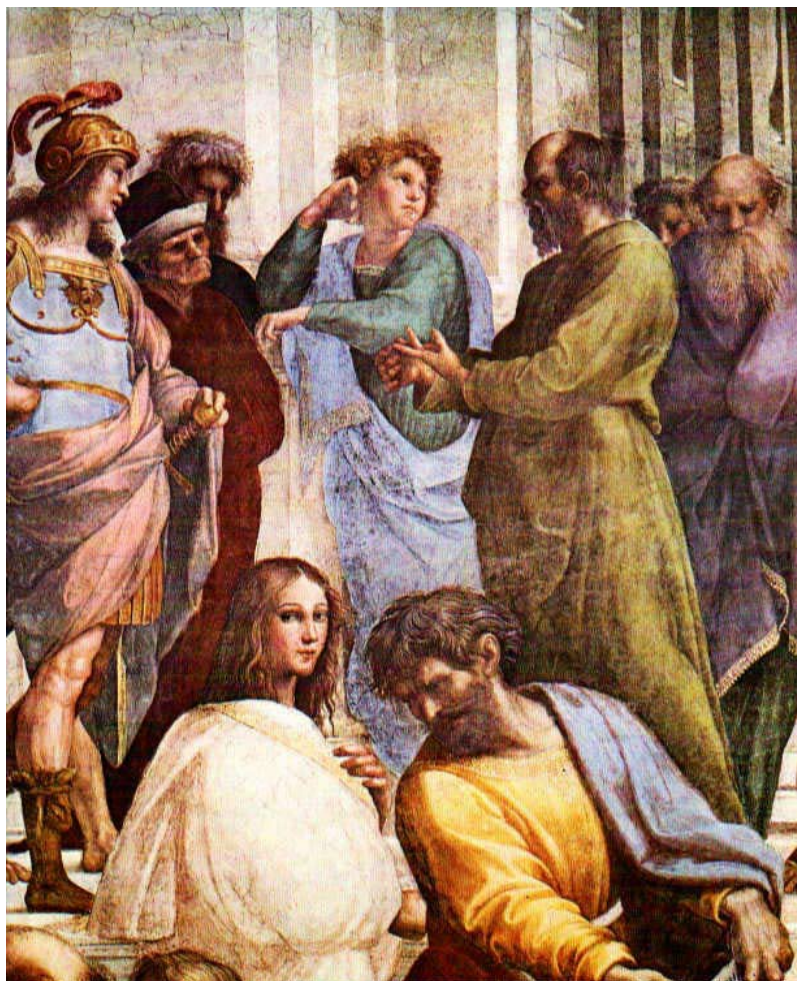
"Mankind is so gripped by their own fearful prescience of human mortality, that they do not even suspect the purpose in mortal life which they should be seeking." Raphael's "School of Athens" (1510), in the Vatican, portrays the principle of immortality. Shown: a detail, with Socrates (top row, second from right), in dialogue with other members of the Platonic Academy.

as if continued life of the soul might suggest the assembly of souls, from assorted past times, portrayed by Raphael Sanzio's The School of Athens .