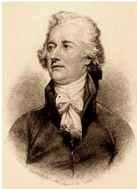
The U.S.A.’s first Treasury Secretary, Alexander Hamilton, was murdered by the British agent Aaron Burr, for his role in creating the “American System of political-economy.”

The habits associated with those assumptions and practice, “hedge-fund-like” stealing aside, have no functional correspondence to any useful, physical-economic function. However, because of the broad influence of the use of the special language of “economics” used as a rationale for the widespread practices and influence of the British empire, they have supplied many otherwise mutually differing bodies of opinion about economy, with what became a common special language of accounting for discussion among representatives of various proposed theories respecting human economic footprints. The consequent discussion proceeded without discovering the physical principle expressed by the actually walking man. Ordinary economists’ practice tells one of certain measurements and certain reportable conditions and events, but tells one virtually nothing of intrinsically physical-scientific interest about why an economy behaves as it does over the medium to short-term intervals, and, with some historical lim-