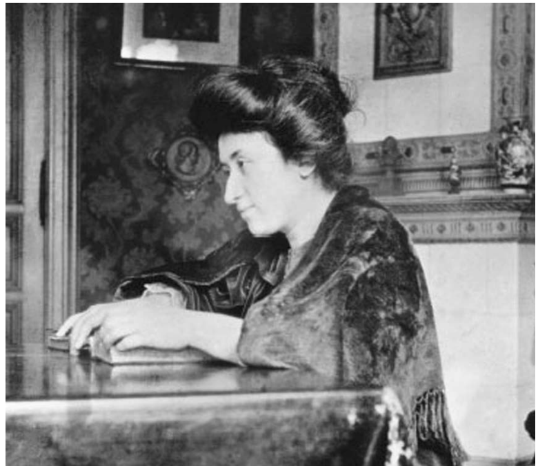
Rosa Luxemburg Foundation

The effect of the relevant, prevalent official delusion, on nearly all sides of decision-making, has been that the determined "market price" of goods has been driven far below the true physical cost of production by the relevant nation: a policy corresponding to what Soviet economist Evgeny Preobrazhensky of the 1920s called his proposed Soviet policy of "primitive socialist accumulation." Preobrazhensky, during his part in the Preobrazhensky-Bukharin debate of that time, was echoing the rather uniquely competent insight by econo-