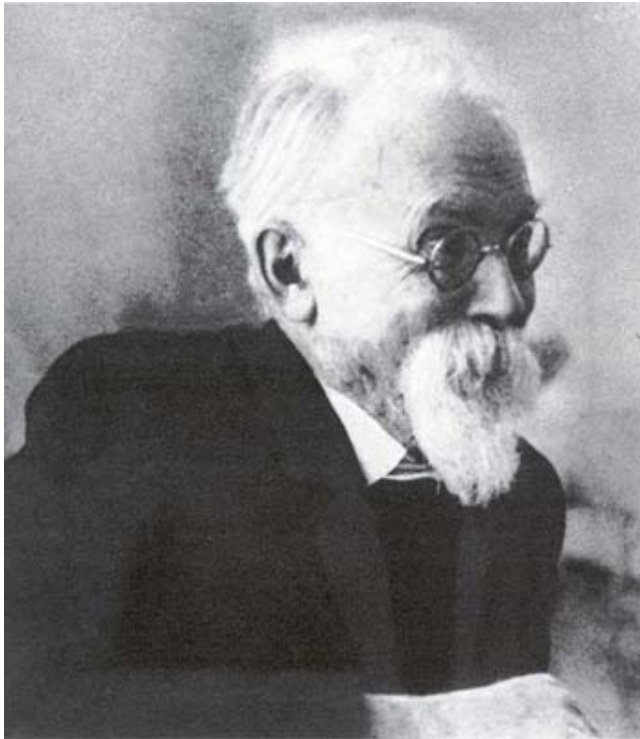
With the work of Russia's Academician V.I. Vernadsky, modern, 20th-Century physical chemistry, for the first time, identified the crucially determining distinctions of physical principle among the three interacting categories: the abiotic-in-principle, Biosphere-in-principle, and the Noösphere.

lishment of a transcontinental railway system which is being upgraded, step by step, from friction-rail, to magnetic-levitation systems operating at speeds in the range of propeller-driven aircraft.