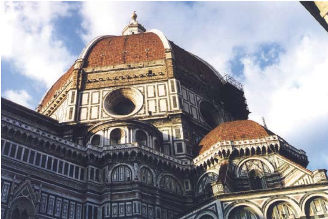
Brunelleschi's dome, the cupola of the Santa Maria del Fiore Cathedral in Florence, was constructed using the catenary principle.

Eighteenth-Century opponents of the Leibniz calculus who can be suspected of the competence to know with certainty that what he wrote about the calculus was a willful fraud. 10 Those others also to be regarded customarily as the originators of the hoax, such as Abraham de Moivre and D'Alembert, had shown no relevant competencies in the actual scientific issues, whereas the Euler, who had been a student of Jean Bernoulli, knew that what he wrote on that matter in 1761, and later, was a fraudulent representation of the clearly stated intention of both Leibniz and Bernoulli's statements of the principle of physical least action. 11