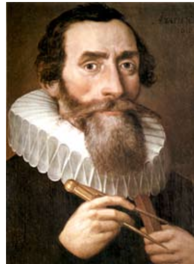
Johannes Kepler (1571-1630)

outcome must be exactly what we encounter in the dogma of Clausius, Grassmann, Kelvin, Helmholtz, and the curiously disgusting aspects of Maxwell, Ernst Mach, Bertrand Russell, and their devotees. The so-called "Second Law of Thermodynamics," when presented as a universal law, was always a hoax of a literally Napoleonic enormity, which was a spectacular model to be promoted by a man of his size.