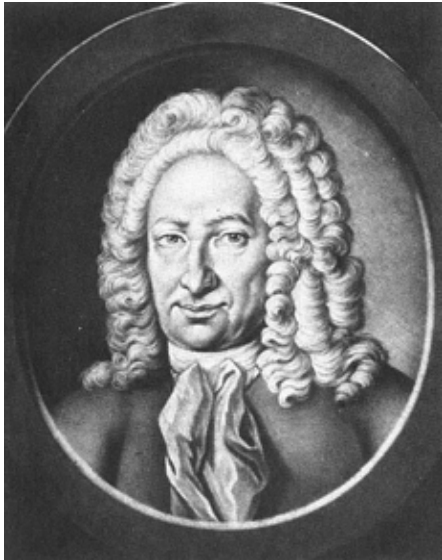
Gottfried Wilhelm Leibniz (1646-1716)