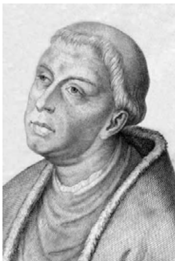
Nicholas of Cusa (1400-1464)

If one accepts the argument, respecting the calculus and modern algebra generally, which is common to de Moivre, D'Alembert, Euler, Lagrange, Laplace, and Cauchy, the