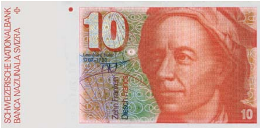
A Swiss banknote commemorates the swindler Euler as Switzerland's finest mathematician.

quality of an analog function, not a digital one, can represent the relevant model of relationship pertaining to true universal principles as such. Contrary to the intentional fraud by Euler, the existence of the Leibniz infinitesimal, is not that of a small magnitude within the domain of the planet's orbit; it is a principle of change, operating from outside the motion of the planetary body as such, which is acting with "infinite density" on that trajectory, and is, therefore, ontologically, not metrically, infinitesimal in that sense.