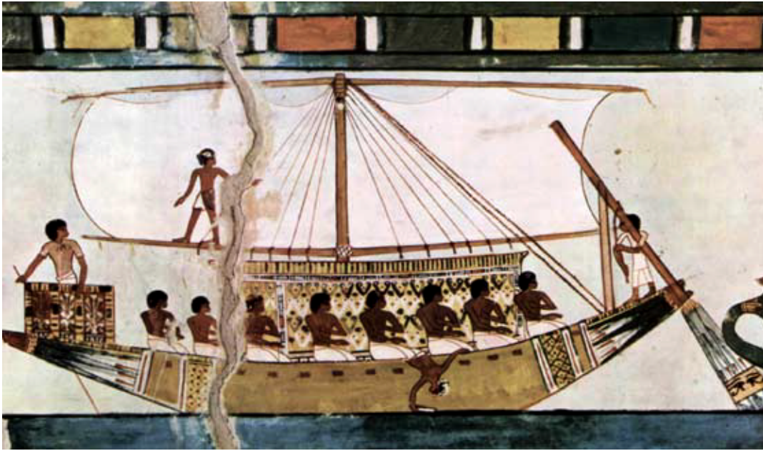
The dominant cultures of mankind were maritime, spreading their ideas across the oceans. Here, a painting of an ancient Egyptian ship, ca. 1450 B.C., from the tomb of Menna.

trade? What is the required change in approach? What is the crucially underlying difference between the two?