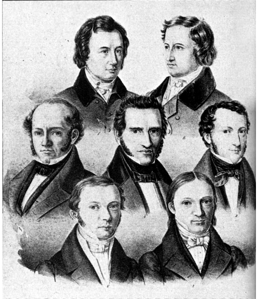
In 1837, a group of Göttingen professors, including Gauss's collaborator, Wilhelm Weber, publicly protested changes in the state constitution by the new king, and were expelled from the University. The Göttingen Seven, as they became known were top row: Wilhelm Grimm, Jacob Grimm; middle row: Wilhelm Eduard Albrecht, Friedrich Christoph Dahlmann, Georg Gottfried Gervinus; bottom row: Wilhelm Eduard Weber and Heinrich Georg August Ewald.