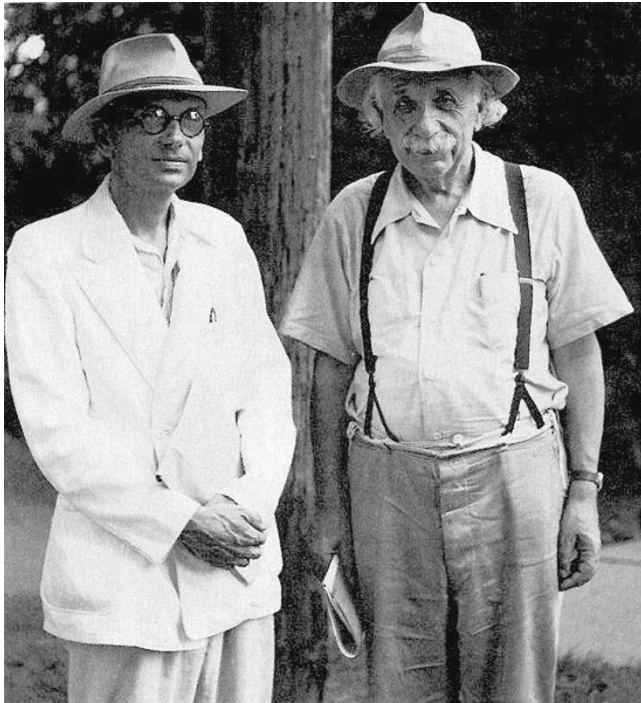
Kurt Gödel (left) with Albert Einstein. Gödel's work demolished the systemic flaw behind Bertrand Russell's Principia Mathematica , a revered example of modern European Liberalism in the classroom, which substituted algebraic formulas for knowledge of principles.

much deeper implication of Kurt Gödel's famous work exposing the systemic fallacies, viciously and fundamentally permeating Bertrand Russell's Principia Mathematica . 8 This time, I carry the argument to a qualitatively deeper level than I did, recently, in my earlier presentation of this notion of method.