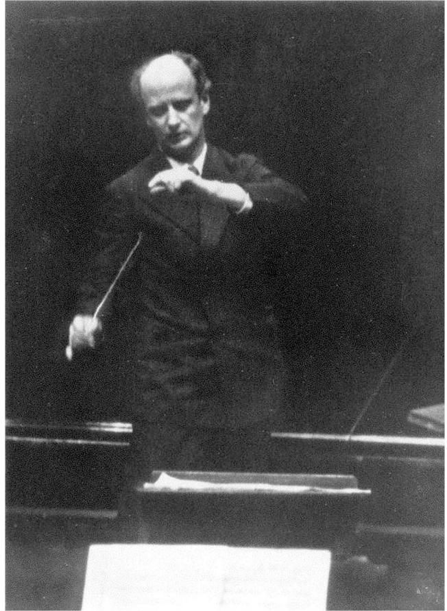
The late Wilhelm Furtwängler, the greatest conductor of the 20th Century, conducts the Berlin Philharmonic. For Furtwängler, the moments of silence which begin and end a piece, were of vital importance, linked by nothing but principled development.

Universal gravitation, as originally, and uniquely discovered by Johannes Kepler, for example, encloses the universe,