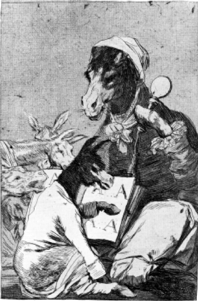
¿Sabría más el discípulo?

At Gore's predecessors from Spain of the late 18th/early 19th Centuries. "Los Caprichos" by Francisco Goya: "Might not the pupil know more?"