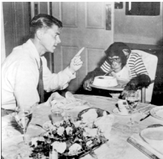
Screen-star (and later President) Ronald Reagan, is shown here with the chimp, from the movie "Bedtime for Bonzo." Today, it's bedtime for Al Gore, who should be restricted to the confines of his mansion in Tennessee, for the safety of future generations.

must serve, promote, and defend against all corruption. I explain the aforesaid connections.