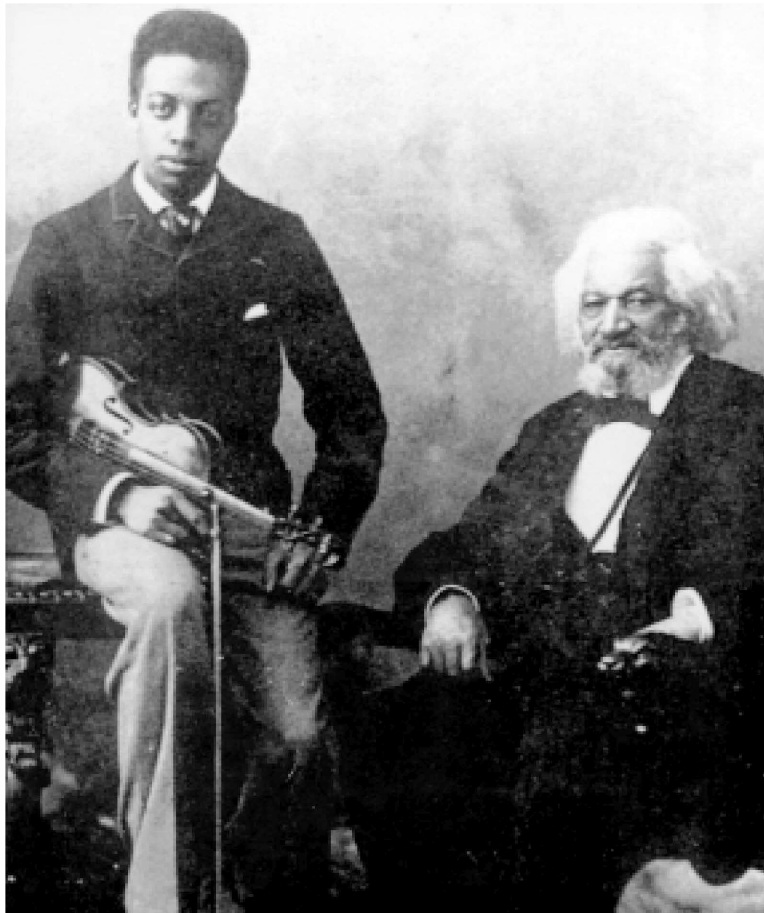
Library of Congress

Aeschylus' Prometheus Bound thus points to the most crucial issue of what is rightly termed "natural law" in society.