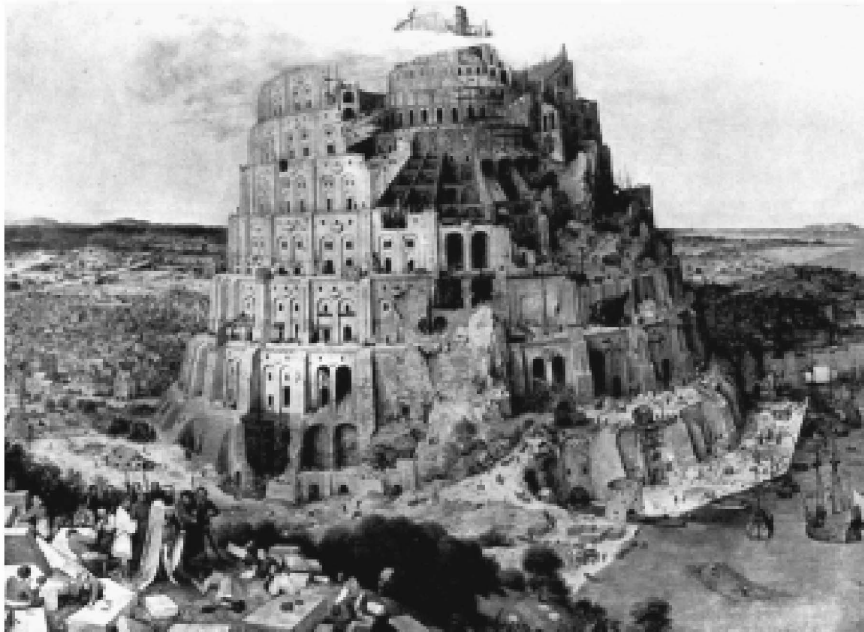
Human culture means, fundamentally, the progress of development of the specifically human cognitive powers of the human species, in opposition to globalization's "Tower of Babel" (e.g., "Babble"). Shown here, Peter Bruegel's painting "The Tower of Babel" (1563).

These considerations lead our attention to two, successive statements of principle respecting human nature. The first step, especially in the U.S.A. today, is to recognize the true genius of Frederick Douglass, as against all those foolish fellows, especially among the "macho-like" behavior of some descendants of slaves, who reject Douglass's wisdom on this account.