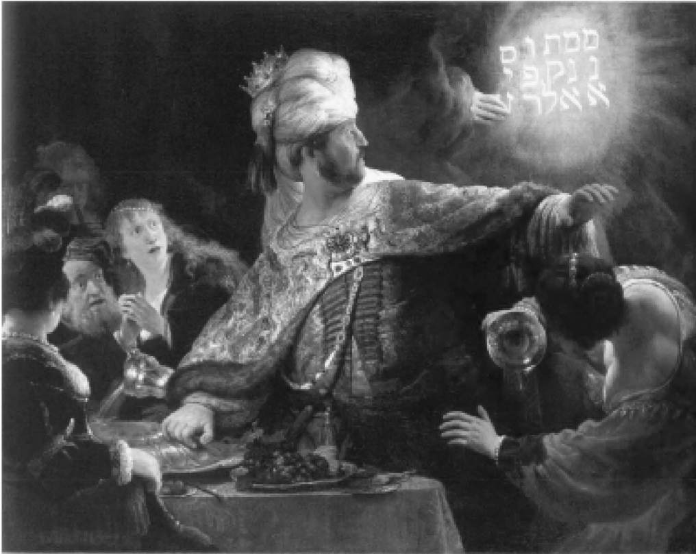
In Rembrandt's painting of "Belshazzar's Feast" (ca. 1635), the King of Babylon commits blasphemy against God, and then realizes in horror his error when he sees the writing on the wall. That very night Belshazzar was slain. Some recognize in Al Gore a similar evil personality.

of man's willful power in, and over the universe, a power which defines man and woman, as Genesis 1 describes this, as set apart from, and above all other living creatures, as man and woman made equally in the likeness, in nature, and character of duties as the servant of the Creator. This is the quality of power, unique to mankind, whose existence is illustrated by the uniqueness of Kepler's discovery of that harmonic principle of universal gravitation which orders the composition of the Solar system as a whole. 5