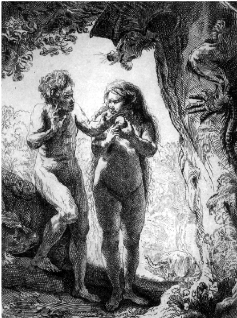
The distinction of human from animal life, writes LaRouche, “is the fundamental issue of economy, which separates my own commitment to truth from the prevalent, Liberal, views and practice of political-economy today.” Here, Rembrandt’s “Adam and Eve” (1638). Rembrandt portrays the couple paradoxically, as not yet fully human, not yet enlightened by reason. The viewer is led to ponder the necessary role of culture, in bringing human potential fully to life.

For example: were the human species a member of the category of higher apes, the population of our species could not have ex-