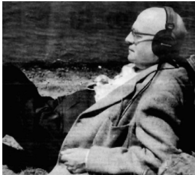
Hofstadter was much impressed with The Authoritarian Personality, a project directed by Theodor Adorno (shown here). LaRouche writes that Hofstadter and Adorno’s German existentialist circles, typify the generation of Liberals “which opened the gates before my eyes, for my clearer view of sundry sorts of Hellish tyrannies which I have witnessed in those times past.”

The Liberal’s faith is, essentially, his fear of lacking the power of suggestion to “win friends and influence people” honestly. He is often stickily gregarious, but never really