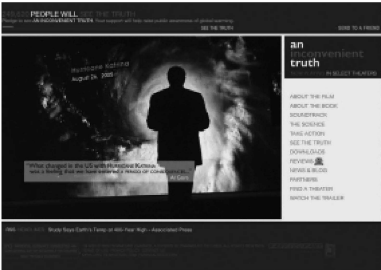
Advertisement for Al Gore's propaganda film on "global warming." LaRouche comments that "although an increasing number of governments, and other circles, have declared their intention to cope with what are called the challenges of depletion and pollution of planetary resources, most of the globalist policies recommended and actually implemented thus far, have been treatments worse, even far worse than the alleged disease."

lenges of depletion and pollution of planetary resources, most of the globalist policies recommended and actually implemented thus far, have been treatments worse, even far worse than the alleged disease. In fact, the systemic implication of the modern Delphic, neo-dionysian cult of "environmentalism," is that such attempted impositions of law place man on the same categorical level as the beasts eaten for food. The present, bestial view of mankind advocated by the current crop of neo-malthusians, must be replaced with a view which is actually in accord with the reality of nature, the reality of the absolute, mental distinction, and qualitative superiority of the human species, the distinction from, and absolutely above all other forms of life.