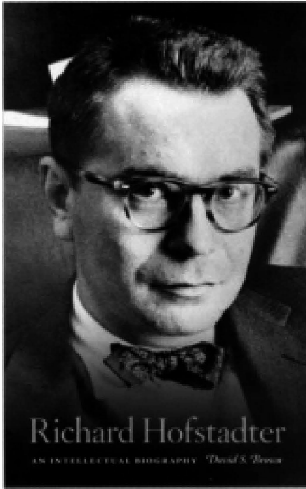
University of Chicago Press

“Hofstadter was essentially a Sophist,” writes LaRouche. “His significance today is that he thus typifies the cultivated, post-Franklin Roosevelt ideology of those . . . whose consciences have betrayed the Democratic Party’s Franklin Roosevelt legacy. . . .”