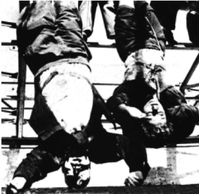
At the end of the war, Benito Mussolini was trying to cut a deal and blackmail Winston Churchill, who had previously been his controller. The British caught him and his mistress, Carla Petacci, and hung them upside-down.

vate financier interests, which, together with the Anglo-Dutch interests, became essentially a world empire. And what people think of as economics today, is largely a product of this system.