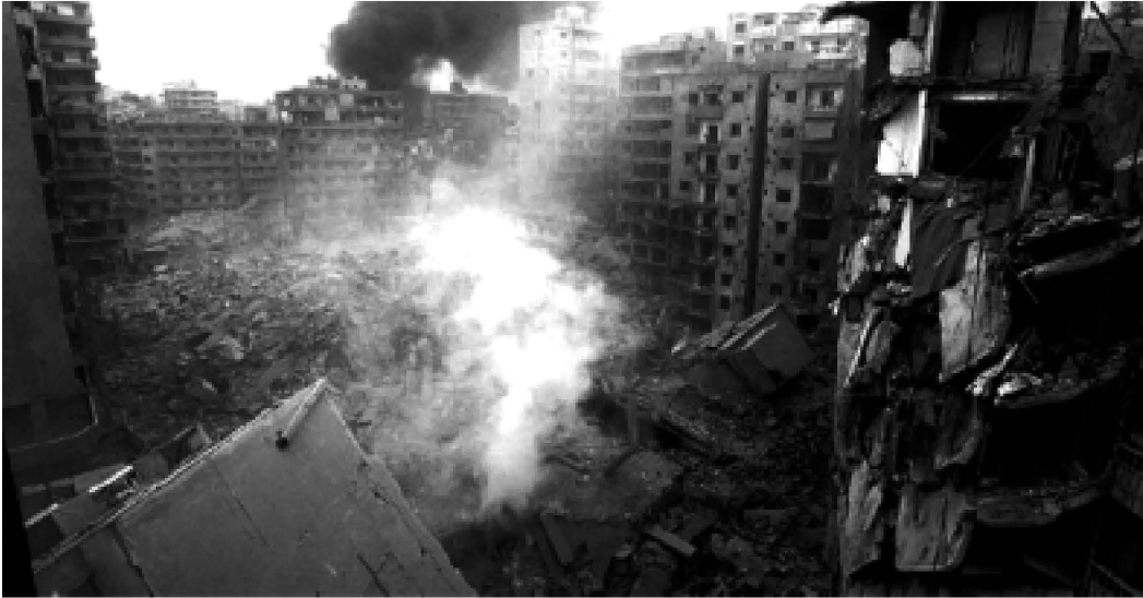
Embassy of Lebanon

With its relentless bombing of Lebanon, LaRouche said, "Israel has walked into something which is a piece of stupidity and a piece of willful suicide." Here, Beirut in July.