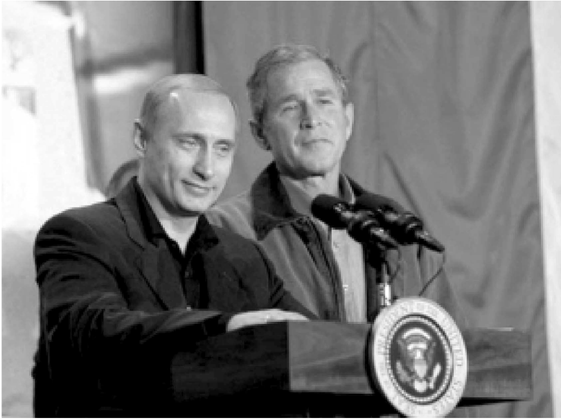
Presidents Putin and Bush in Crawford, Texas. Putin has made the terrible blunder of thinking that a four-way great-power division of control over raw-material resources can succeed in superseding the existing financial-economic order.

volves the raw materials (minerals, including oil) of South America, Africa, Northern and Southwestern Asia, and China. There is an emerging bloc between Western Continental Europe and Russia, a distinct role by China, and the U.S. faction.