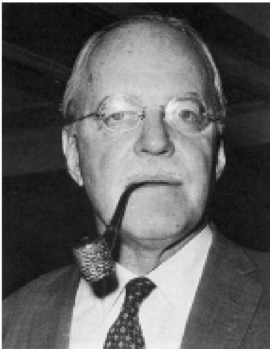
President Harry Truman (below) and his CIA director Allen Dulles. LaRouche reports that with Truman’s installation as President after the death of Roosevelt, the United States turned to the right, “as typified by Allen Dulles’ bringing a section of the Nazi SS apparatus into what became that Nazi element of the Gladio secret system in Italy. . . .”