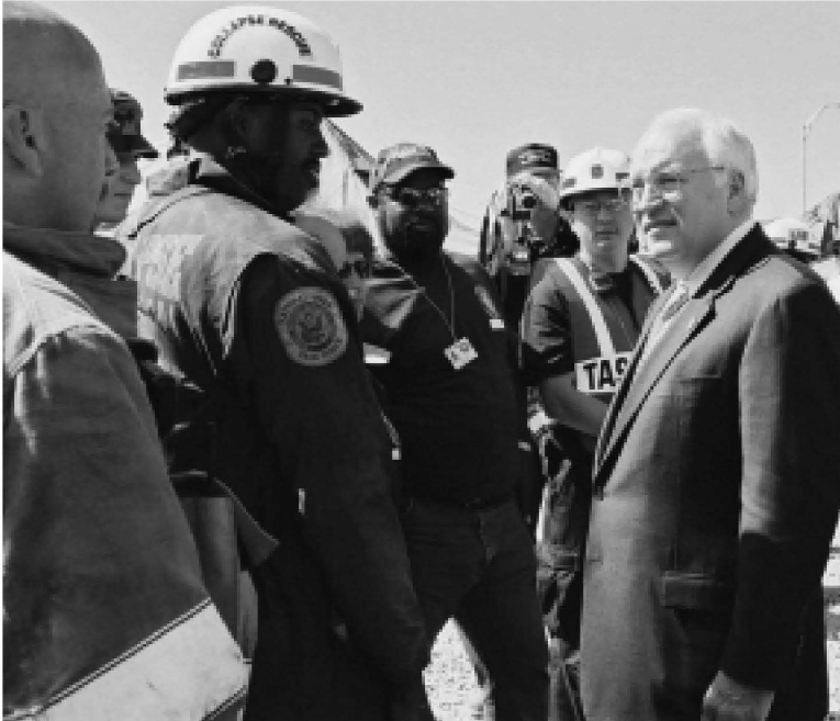
Vice President Dick Cheney with rescue workers at the Pentagon on Sept. 16, 2001. "Cheney himself probably shuddered in stark fear at discovering what his secret masters had done on fateful Sept. 11, 2001, and is probably shuddering still, to the present moment. Since then, to the present day, that recurring, haunted man's shudder, is probably the most honest thing about the otherwise essentially dishonest Cheney."

ments under which the majority of the population is degraded to the status of human cattle, such as the herded human cattle of Quesnay's code of " laissez-faire " and Adam Smith's "free trade," or the hunted cattle of Brzezinski crony Samuel P. Huntington's target, Islam. The collateral form of the oppressor of mankind has been the reigning oligarchy. Since ancient imperial Rome, the leading expression of that abomination known as financier-oligarchy has been Venice and Venice's clone and successor, the Anglo-Dutch Liberal system of predatory usury. Among the latter, neo-Venetian Liberals, the most feared and hated adversary of financier-oligarchical power, has been the American System of political-economy as associated with the work of U.S. Treasury Secretary Alexander Hamilton, the latter the foe of the treasonous Aaron Burr, of the Bank of Manhattan, who was himself an intelligence asset of the British Foreign Office secret committee head Jeremy Bentham.