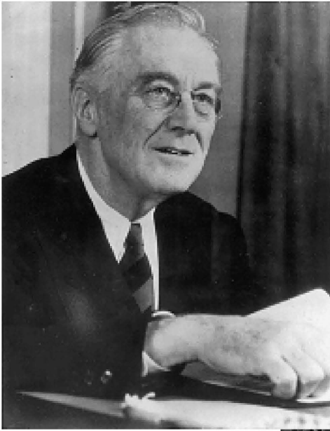
President Franklin D. Roosevelt—and his funeral procession in Washington, D.C. in 1945. LaRouche, then stationed in India, was asked by GIs what the President’s death meant. “My reply was that I did not know, but that I was greatly worried by the replacement of a great President by such a little man.”