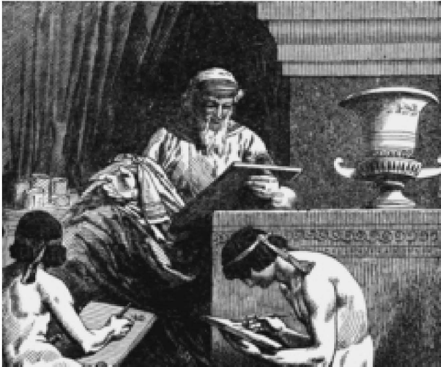
Solon, the lawgiver of Athens, in the Sixth Century B.C., initiated the long historical struggle to establish a true nation-state republic, in opposition to the effort typified by Sparta under the Constitution of Lycurgus.