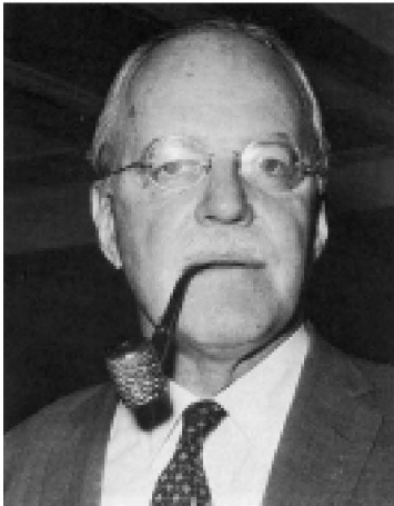
Allen Dulles, first of the OSS, later of the CIA, typifies those who played a key role in bringing a key part of the Nazi SS intelligence apparatus into what later became the NATO system.

ist elements, were collected to form a combination of other Continental European fascist networks, and were integral to the Franklin Roosevelt-hating, Anglo-American networks associated with Henry Luce's already existing project for "A New American Century."