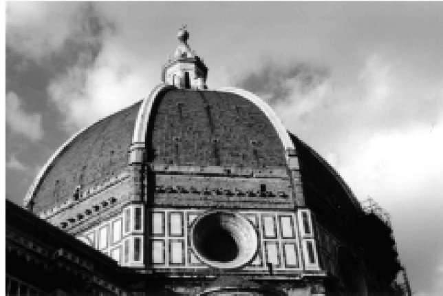
Brunelleschi's cupola of the Cathedral of Florence, one of the Renaissance's monumental achievements. In the shadow of the dome, "the bestializing legacy of empire gave way to the notion of a community of sovereign nation-states each and all committed to promotion of that general welfare of mankind."

those principles of civilized relations among sovereign nation-states which were adopted by the 1648 Treaty of Westphalia.