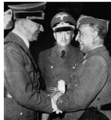
The same Synarchist International that created Hitler, Mussolini, and Franco (Hitler is shown here with Mussolini on the right, and with Franco on the left) also produced that subversive enemy of ours who later appeared under such significant labels as the Congress for Cultural Freedom (CCF); the evil was expressed both as fascism and as the philosophy of the CFF promoted by followers of Allen Dulles.