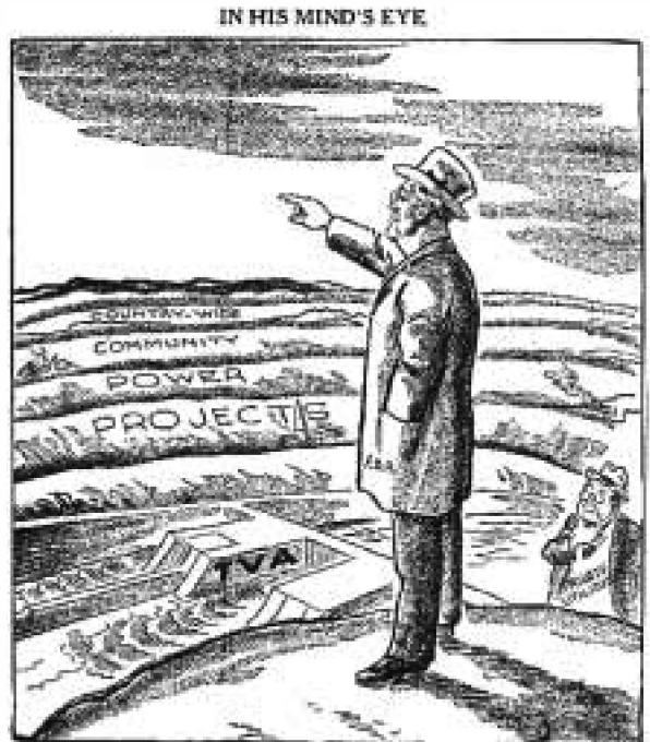
When President Franklin D. Roosevelt took up the cause of the “Forgotten Man,” during the depths of the Great Depression, he gave the nation hope. His Tennessee Valley Authority and other infrastructure projects put people back to work, reviving industry and laying the basis for the military victory over Nazism.