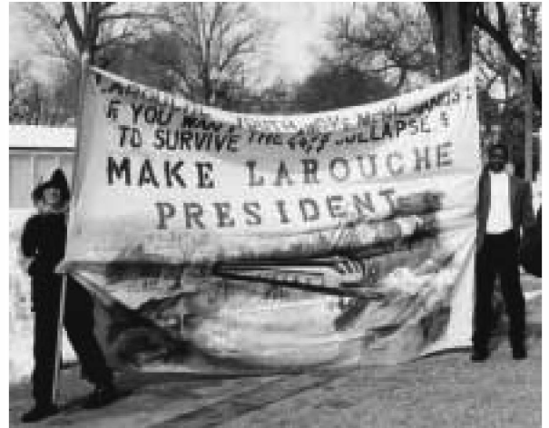
The LaRouche Youth Movement demonstrates in Washington on Feb. 19. They also conducted lobbying of Senators and Congressmen. "The youth are going to tend to turn to me; because I recognize their problem, and I demand justice, or relief from that problem. And that's why we're having a great impact. We're recruiting at a rate which even astonishes me."

of families which were connected to these money families. And they stuck her as an apprentice in the White House basement. And she had a reputation as a stalker from her high school days. And she was stuck there.