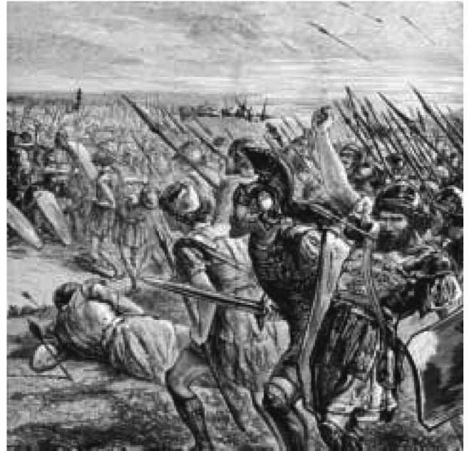
The Bush Administration is repeating the folly of ancient Athens, which launched the Peloponnesian War, thereby dooming itself. Here, the Battle of Marathon in 490 B.C., where Athens defeated the Persian army. It later tried to become the imperial superpower of that time.

If you're just tuning in ladies and gentlemen, Lyndon