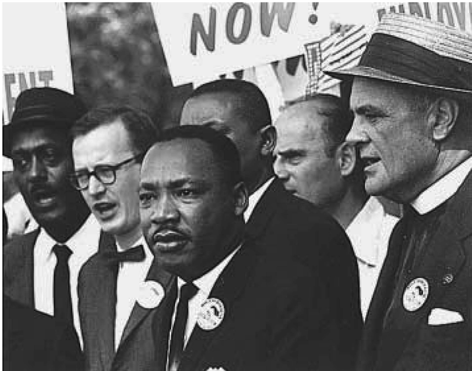
Dr. Martin Luther King during the Aug. 28, 1963 March on Washington. King's sublime leadership was a contribution to the welfare of the nation as a whole. The demand for "reparations" today represents a descent to a lower cognitive level, reflecting the failure of the civil rights leaders who succeeded King, to live up to his moral standard.

ness inside the U.S. military and other institutions, which were opposed to Roosevelt's policy on war against Hitler, and so forth. And that these people goofed. They were not enthusiastic for Roosevelt's preparations, which had started in 1936, to prepare the United States for the inevitability, at that point, of a world war launched by Hitler. And that was the issue.