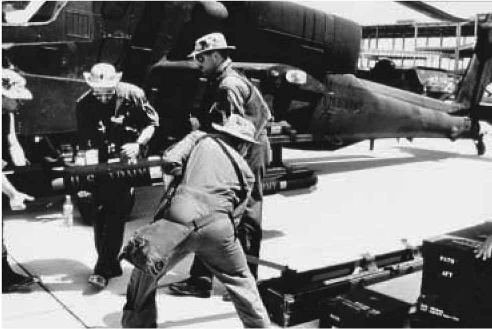
U.S. troops in Saudi Arabia, during the Gulf War of 1991. Today, the conditions are very different: The U.S. economy has collapsed, and the rest of the world has no confidence in the current U.S. leadership. "Therefore, the United States is going into a war, essentially, on its own. It's a war which would be, probably, a trillion-dollar war, if you consider the aftermath of an attack."

First of all, the world is in a great financial crisis. Secondly, on the hind-side of the past dozen years, the world recognizes that the past dozen years' policy was a catastrophic failure. Therefore, anyone going back to 1990-91 now, would say, "Don't do it."