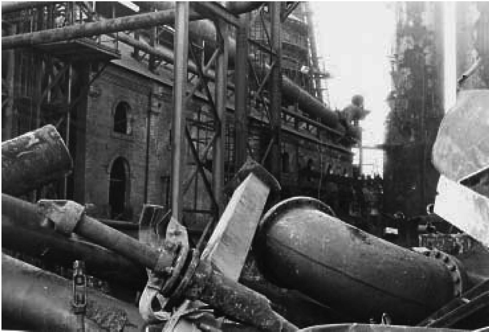
Demolition of a steel mill in McKeesport, Pennsylvania, in 1985. American populists cut their own throats by supporting free trade and deregulation, in the interest of getting a “cheaper deal.” The result: no U.S. economy!

bankruptcy, or they were about to settle the problem with Geneva Steelworks; and as it turns out, what they were talking about is a company moving in, that will buy it all out, and dismantle the steel plant to the ground , and build a “business park.”