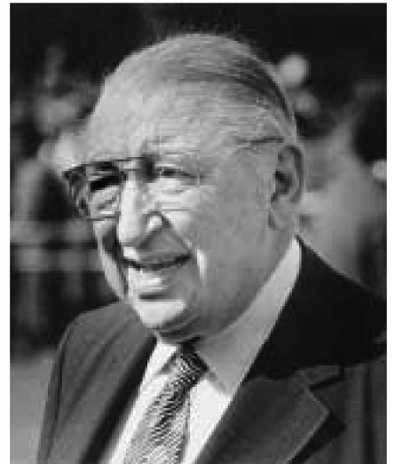
“The friends of Max Fisher behave like thugs, not as Democrats. They’re not interested in discussion; they’re not interested in the truth; they’re interested only in getting money from these families which are traditionally organized-crime families.” Left to right: Ronald Lauder, Sen. Joe Lieberman, and Max Fisher.

you get this kind of thing, you get a sense: This is really Satanic stuff.