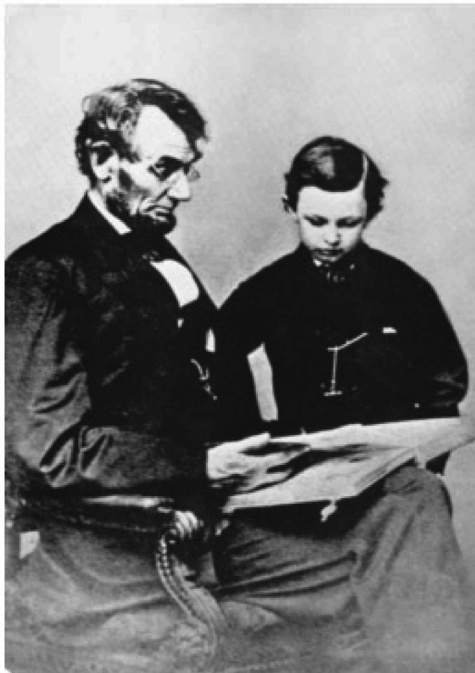
Abraham Lincoln with his son Tad, 1864. “When history takes the proper turn,” writes LaRouche, “the cultural development accomplished by the successive work of the grandparents and parents, blossoms in the achievements of the grandchildren’s generation.”

ment of today’s policies without looking at the effect of those policies on the condition of both that nation, and also the world, over a period of not less than approximately two generations ahead. In other words, he or she must think of the trajectory of human development, as the original discoverer of gravitation, Johannes Kepler, defined the annual orbit of the planet Earth. For that reason, the morality of each adult generation, is to be measured by its attitude toward its own adolescent or young-adult children, an attitude which must be measured, at each point in time, as the effect of that attitude