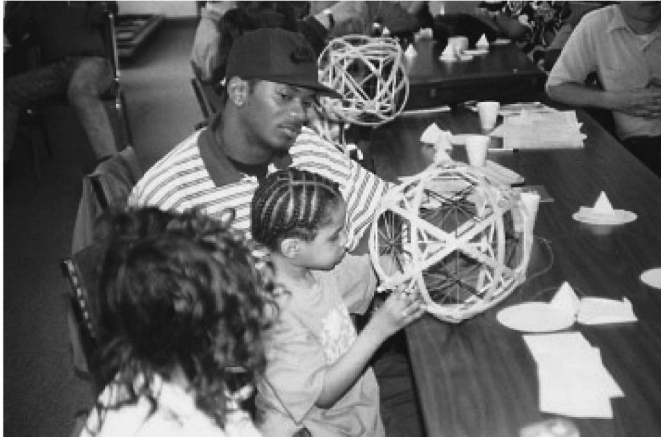
A Schiller Institute geometry workshop in Boston. A humanist education begins with the investigation of physical principles which point to real-life facts, contrary to an abstract classroom geometry—the issue upon which Gauss clashed with Euler and Lagrange.

of Lagrange’s effort to systematize physics as a system of mechanical action located within the Euclidean-Cartesian domain of empiricists such as Abbot Antonio Conti.