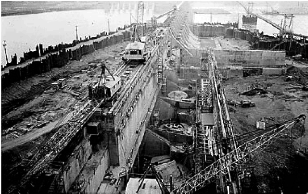
Construction of a dam and power plant by Roosevelt's Tennessee Valley Authority in 1942. Such state-organized public works can supply an effective degree of relative (Riemannian) physical-space-time curvature to the domain within which the relevant private enterprises are situated.

entrepreneur, as farmer or manufacturer, does not disregard the role of large corporate enterprises. However, we must recognize the danger inherent in the role of a profit-interest which seeks to divorce itself from a sense of primary accountability to the public, rather than merely private (e.g., “shareholder” interest). On the latter account, the state must circumscribe the corporate form of for-profit private enterprise with its own adopted devotion to some adopted mission of benefit for society in general, and also impose governmental regulations which channel its behavior into conformity with that adopted, authorized corporate mission. In this example, in as the role of basic economic infrastructure, in economy in general, the primary site of performance is the economy considered as a coherent unit, rather than a sum-total of parts. The whole must be a source of added benefit to the local function, as the local function must be a contribution to the essential mission-function of the society as a whole.