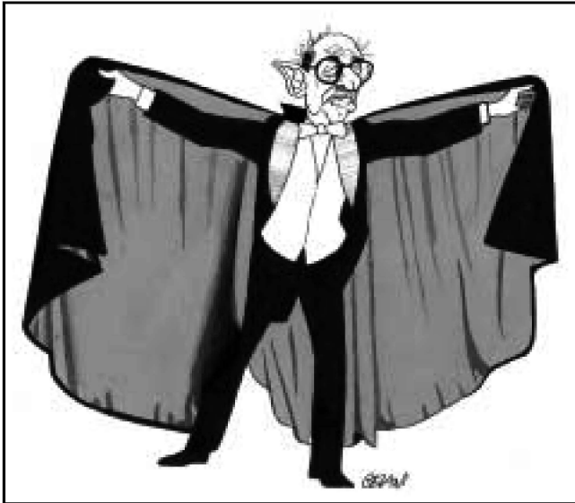
Alan Greenspan's predatory, self-doomed Federal Reserve System is permeated with the systemic error of the doctrine of "free trade"—a doctrine abhorrent to the American System of political-economy.

most crucial fact about today's U.S.A., is now essentially unknown among even leading figures around the world as a whole. The fact is, the recently dominant position of a financier-centered, American Tory opposition to the American patriotic tradition of such outstanding leaders as Benjamin Franklin and Abraham Lincoln, is the principal factor behind the past thirty-five years economic and moral erosion of the U.S.A., from the world's leading producer society, to a decadent, probably doomed "post-industrial, consumer" society.