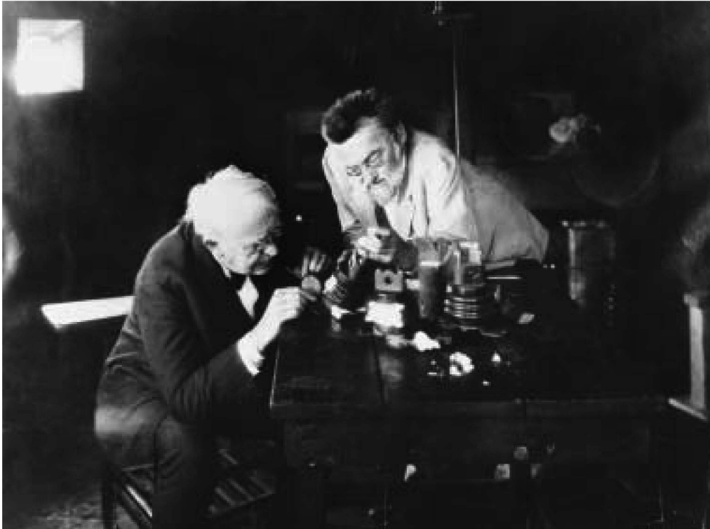
Thomas Edison (left) and engineer Charles Steinmetz typified the spirit of productive entrepreneurship that is indispensable for the progress of a modern economy.

physical economy, and the physical meaning of the use of the notion of powers in both Gauss's 1799 report of his discovery of the fundamental theorem of algebra, and Riemann's definition of the physical-experimental significance of powers within the concluding portion of 1854 habilitation dissertation.