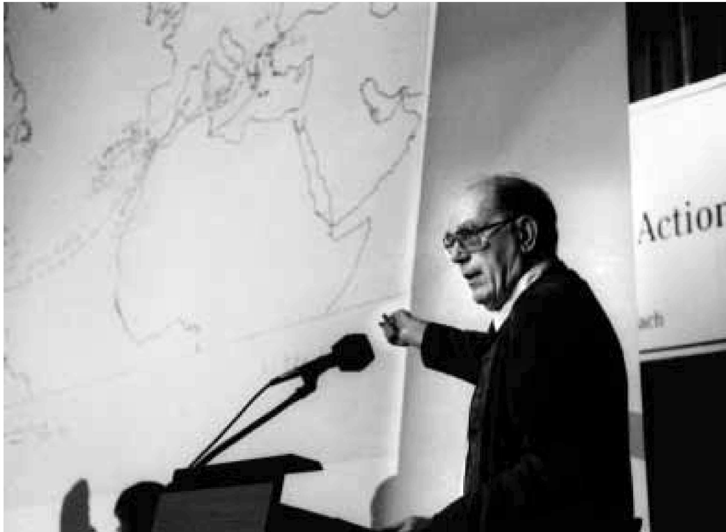
Physical economist Lyndon LaRouche's success in economic forecasting is due to his recognition that "all really important dangers to society arise, like self-inflicted mental illnesses, from popularized, axiomatic delusions, especially official ones."

which made that mistake, will cling self-righteously to his infection by that fatal belief, even for many generations still to come—if the society does not bring itself down much sooner, through the effects of just such false beliefs. Such pathologically stubborn forms of popular opinion of a people, are, again, the root-cause of all great Classical tragedies on stage, and also the real-life national tragedies of entire cultures.