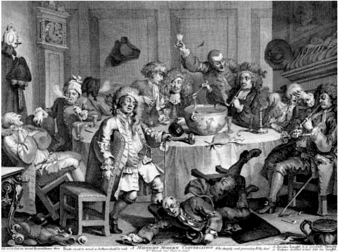
William Hogarth, "A Midnight Modern Conversation."

edly, was seized by a fit of remorse, or, perhaps, triumphalism, and established the temple of snake-worship called the cult of the Pythian Apollo at that gravesite.