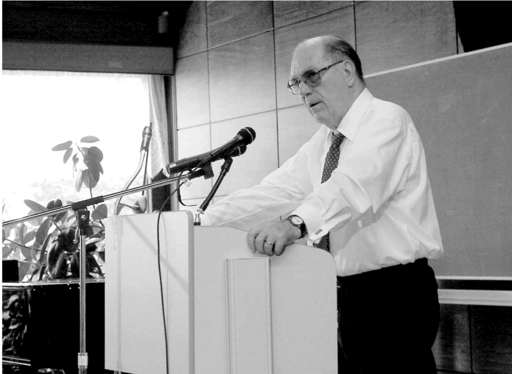
Lyndon H. LaRouche, Jr. at a conference in Germany, August 2001.

like world war. We've had, despite the newspaper reports, an attempted coup d'état in the United States, against the Bush Administration. And, unfortunately, that is the thing we must first consider, because otherwise we would completely misunderstand the world situation in all its aspects.