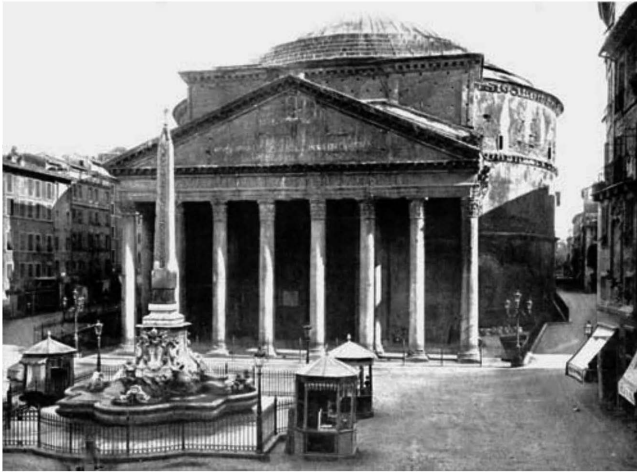
The Pantheon in Rome. "All empires were based on the principle of the Pantheon. And the way that the emperor ruled the empire, was to play the different religions of the Pantheon against each other. What Brzezinski is proposing, is exactly that: a war among cultures, to define the planet as a Pantheon, and to make war among the different religions and cultures of the Pantheon. That is the Islamic 'Clash of Civilizations' thesis of Zbigniew Brzezinski."

I read a radio interview you gave a few hours after the attack on the Twin Towers, in which you spoke about the risk of a depression on a global scale as a consequence of this attack. Is there not a bit of pessimism on your part, regarding the situation which has been created? You spoke of a global crash, or a global collapse, when all of the major international financial analysts, starting with Morgan Stanley, have spoken of a recession which can be overcome in six or nine months.