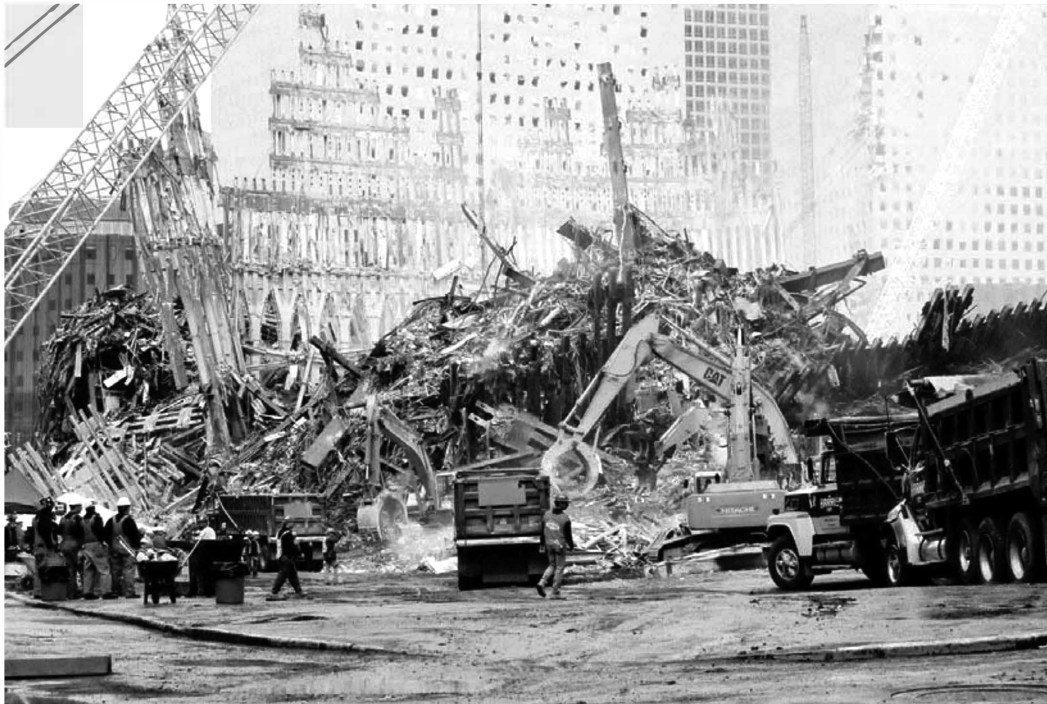
The scene at the World Trade Center on Sept. 13. "You may start a fire in a theater," LaRouche said, "and the people will panic in response to the fire, and then you'll be able to do certain things, in consequence of a few people having panicked many. That's a simple explanation of the way a coup d'état works."

the financial, monetary crisis, which is what I propose, and others have proposed, as a New Bretton Woods approach. Or the idea of the Eurasian Land-Bridge is a very specific way of creating an economic policy, which supports the idea of a New Bretton Woods. It's obvious, it's very obviously needed. Europe, Western Europe, can not survive economically under present conditions. Unless Europe can again export, open up its exports, for technology products, especially into Asia, it can not survive.