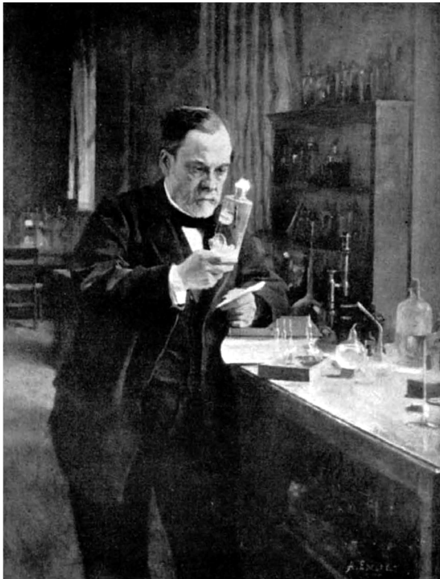
Louis Pasteur inspired the work of Vernadsky, on the matter of defining the efficient existence of a universal principle of life.

tion. Such principles are of the ontological quality which Plato references by his allegory of the shadows on the irregular surface of the wall of a dimly fire-lit cave. The task, as in microphysics in particular, is to discover, and to know with certainty, the existence of the unseen object which casts the shadow. Vernadsky's definitions of both life and cognition, respectively, are each an illustration of Plato's argument. So, the function of education is to be situated within the noösphere.