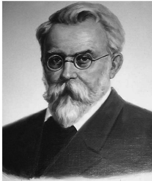
Bernhard Riemann (left) and Vladimir I. Vernadsky. The relationship of the individual to nature investigated by Vernadsky can only be understood from the standpoint of adopting a Riemannian notion of an anti-Euclidean physical geometry.

subject of the noösphere had no functional role within the way in which I originally developed my own discoveries during those early years of my work. 17