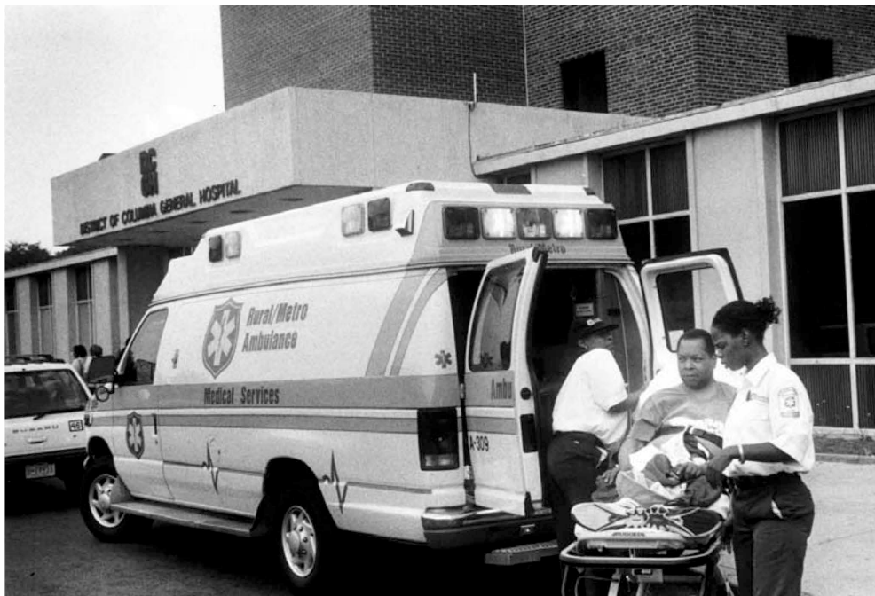
D.C. General Hospital, the only public hospital in the nation's capital, was closed in July 2001, on orders of financial speculators.

Before turning to the issue of energy policy, we could not understand the issues implicitly posed by such changes in medical policy, unless we took into account other aspects of recent international trends toward promoting increased mortality rates in populations. It will be made obvious, immediately following these next remarks, that the exact same principles presented here apply equally to energy policy.