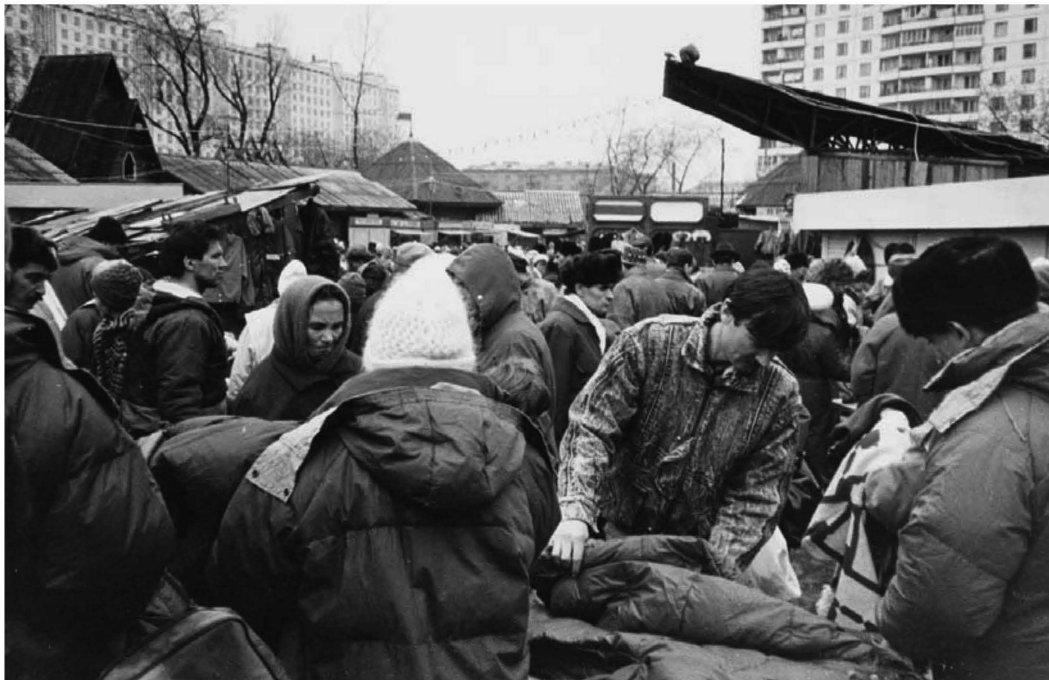
Using “carpet-bagging” methods, the Anglo-American monetarists and their Russian compradors reaped vast physical wealth and financial income, by looting the economies of their victims. Here: street vendors at a Moscow subway station in 1992.

there is no place in the living future of this planet for the kind of politics they practiced in 2000. 1