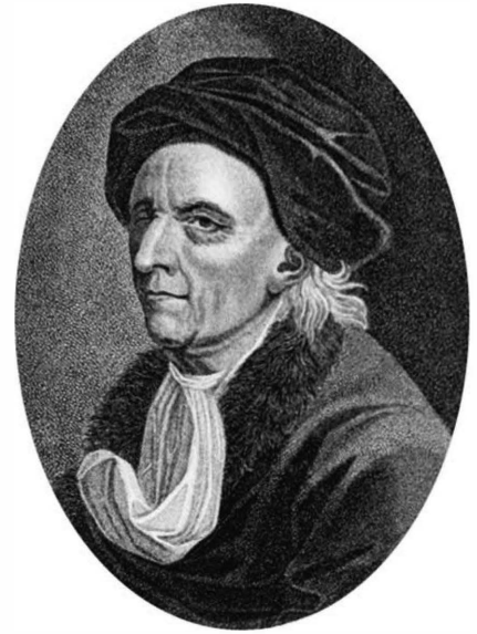
Vernadsky's discoveries implicitly demolish what has become widely accepted as a pro-paganist variety of modern religious doctrine on the subject of thermodynamics. That doctrine is embodied in the work of (left to right) Norbert Wiener, John von Neumann, Leonhard Euler.

the followers of the then-deceased (1749), Paris-based Abbot Antonio Conti, whose Europe-wide network of salons, including the cabal of Maupertuis and Euler at Berlin, had created, as if out of mud, the mythical apotheosis of both Voltaire and Newton. The work of Clausius et al., providing a sophistry on the subject of Sadi Carnot's work, was then arbitrarily extrapolated by Clausius et al., chiefly on the authority of the mathematical assumptions inhering axiomatically in Euler's fraudulent, reductionist representation of the Leibniz calculus. In this way, Clausius, Grassmann, et al., thus introduced the foundations for what became the doctrine of universal entropy.