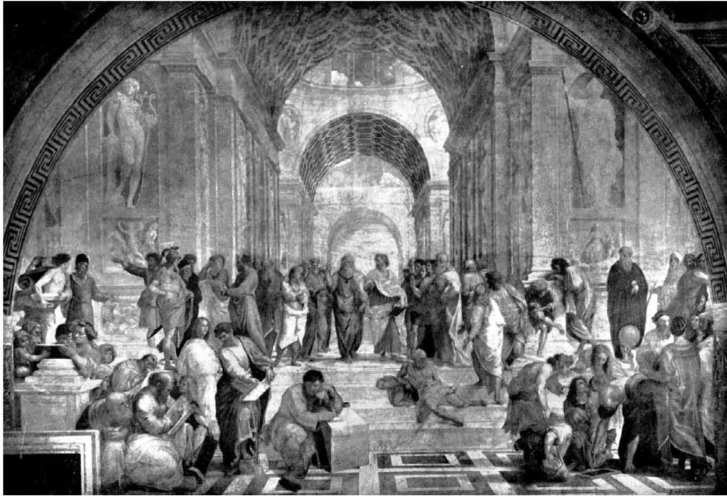
Raphael's The School of Athens .

start from the recognition that, as I have just said, neither valid discoveries of universal physical principles, nor the individual mental processes by which those principles are discovered, are a subject of sense-perception, or of deduction . The act of discovery occurs only as a sovereign cognitive act of an individual mind, a process which is perfectly opaque to the sense-perceptual powers of an observer.