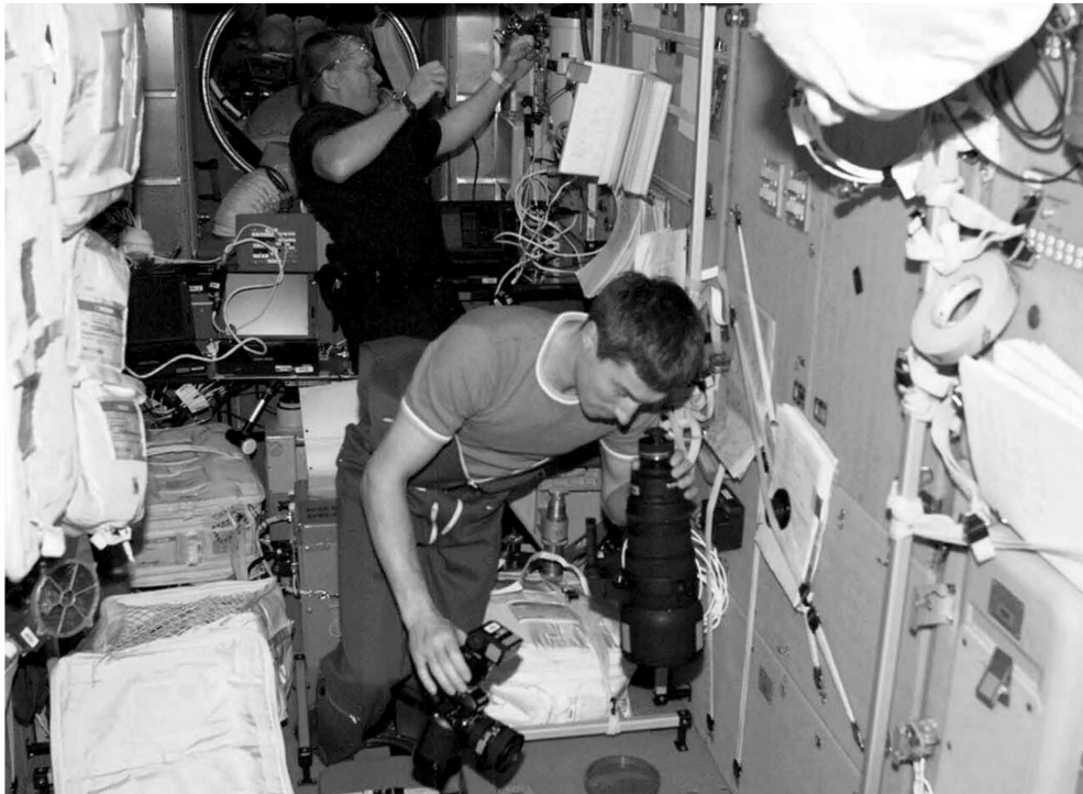
The space program typifies the “science-driver” model of economy. Here cosmonauts and astronauts work aboard the service module Zvezda, on the International Space Station, November 2000.

I have just summarized. In this strategy, we have both greatly increased educational allocations per capita, and have added, as a necessary cost of production for society as a whole, an increase of emphasis on fundamental scientific research, and upon related experimentally-driven development, far in excess of national-income-accounting standards of “fiscal responsibility” in force among nations today. To use a crude, but I think effective imagery, let us say, that in practice, we have defined education, if organized as I have described it here, as the “volcano” from which the directed increase of per-capita net productivity of the productive powers of labor flows. In such a policy, we have chosen to make the generation of new, fundamental discoveries of universal principle, the driving force of national and world economy. In short: a science-driver economy.