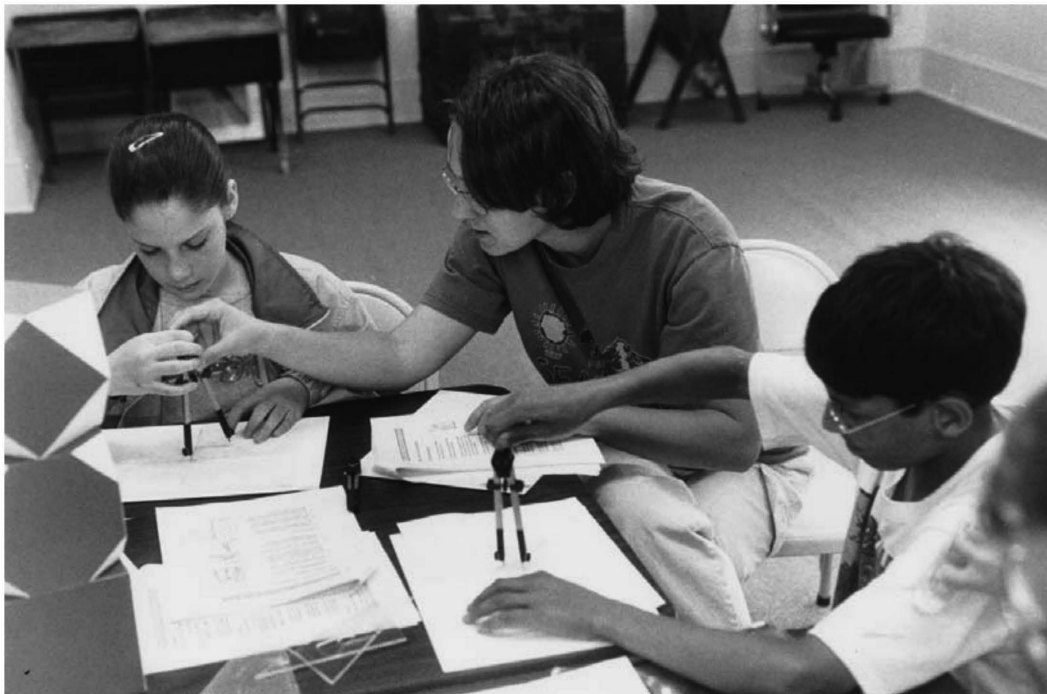
The pedagogical challenge of re-creating a discovery of universal physical principle: a Schiller Institute geometry workshop, Summer 2001.

physical principles to effect such anti-entropic progress of society, we have a way of locating the efficient reality outside our skins, which corresponds to valid ideas generated from inside our skins.