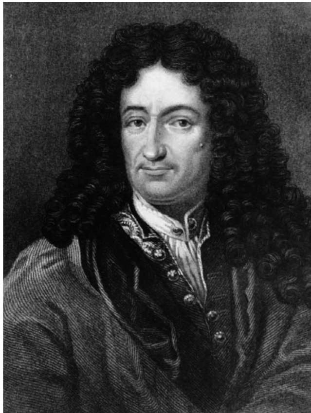
Gottfried Leibniz. "A corrected notion of the differential, one consistent with Leibniz's monadology, is required to define the form of calculations required to overcome the usual blunders in defining measurements of relative economic value."

(the apparent regularity of the orbit) is determining the non-uniform curvature of the present interval immediately ahead. The same quality of irony arises in Fermat's recognition of the principle of quickest time.