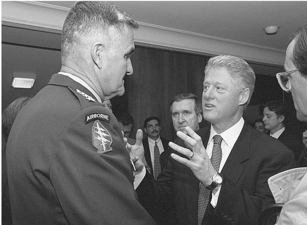
Chairman of the Joint Chiefs of Staff Henry H. Shelton (left) and Defense Secretary William Cohen (center), with President Clinton at the Pentagon, Feb. 17, 1998. Shelton and Cohen, along with the Senate sponsors of S. 257, are carrying out “a farcical resurrection of the silly version of SDI demanded, back in 1983, by the Heritage Foundation’s Lt.-Gen. (ret.) Daniel Graham and kindred stone-age ideologues,” LaRouche writes.

no later than October 1986, the British monarchy and also the National Committees of both the Republican and Democratic parties remained determined to destroy the President’s initiative. Some, as on the Democratic Party side, simply opposed it outrightly. Others, like the Heritage Foundation’s raving and ranting ideologues, concentrated on wrecking the SDI from the inside, by transforming it into something silly.