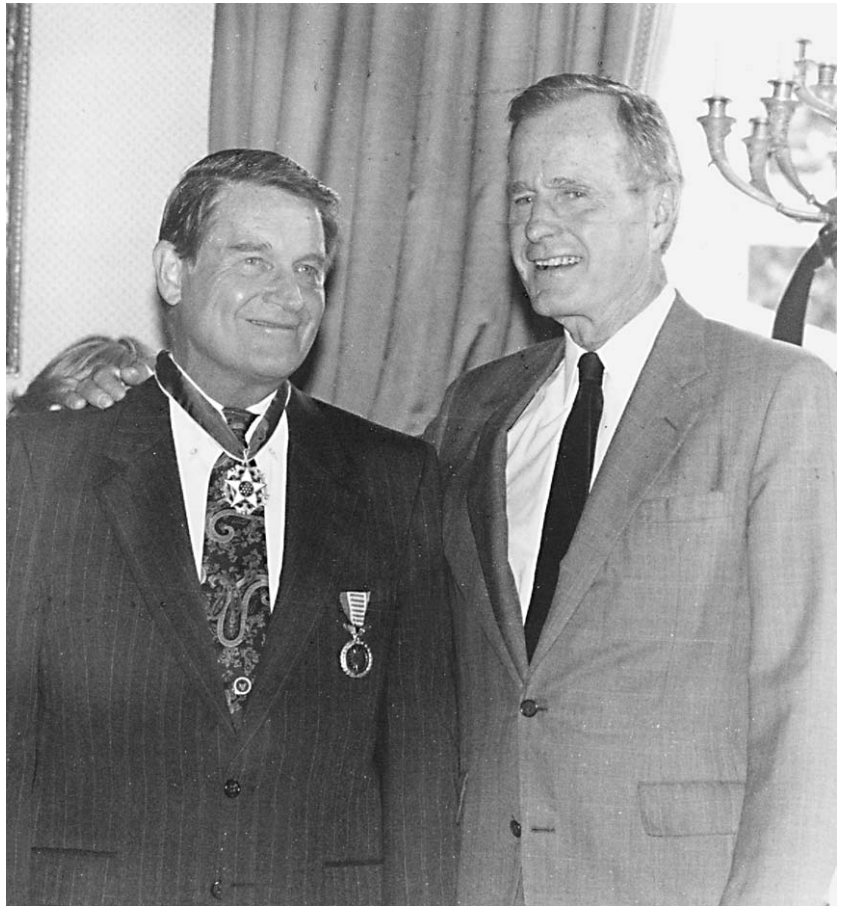
Top operatives of the “Get LaRouche” task force, who used the cover of Executive Order 12333 to jail LaRouche in 1989 (clockwise, from top left): Henry A. Kissinger; William Webster (left) and George Bush; Edward Bennett Williams. The dirty tricks to which President Clinton is now being subjected, bear a striking resemblance to those used earlier against LaRouche.