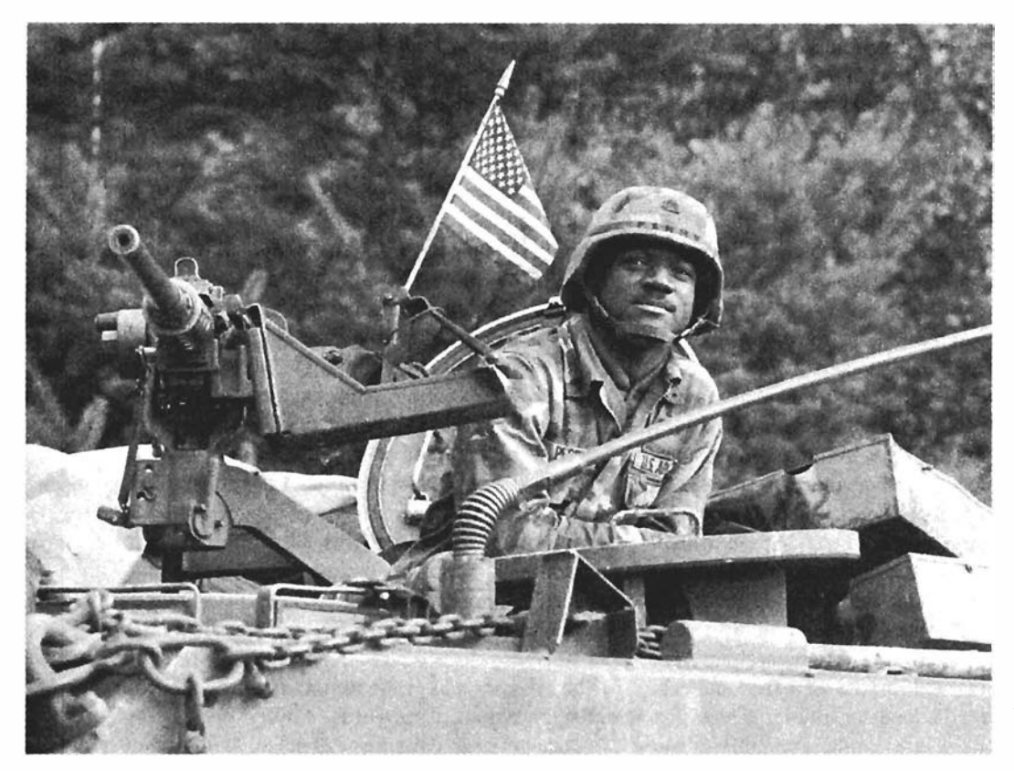
Scene at a NATO maneuver in West Germany, during the 1980s. Today, the questions of strategy are: "What are we defending? What danger should we be committed to eliminating? What means are appropriate to the goals to be reached? The proposals for an expanded NATO address none of these questions."

result of the follies of Moltke and the Kaiser, the war dragged out, destroying much of Europe's civilization with it.