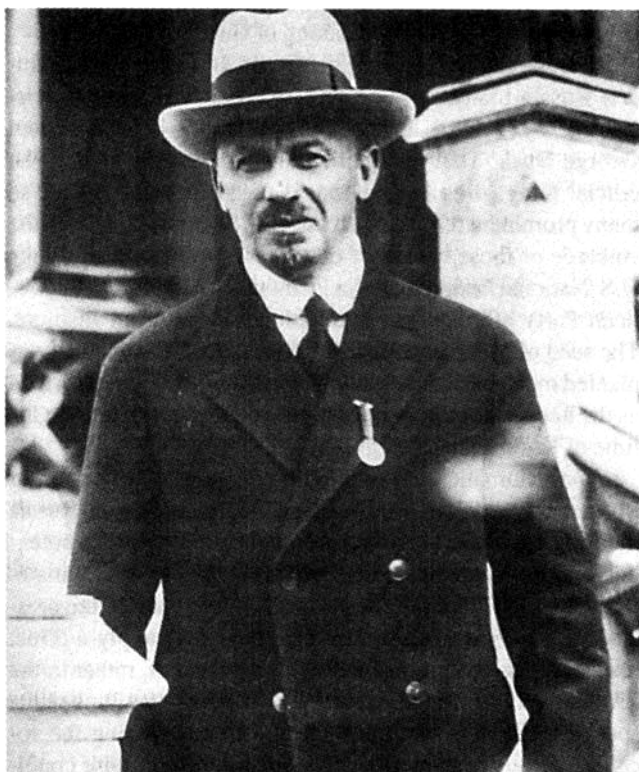
Nikolai Bukharin. The seed of Moscow's current susceptibility to destruction by Margaret Thatcher's "Reform," was planted with the neo-Bukharinist restoration which can be traced to the time of N.S. Khrushchev.

The underlying feature of the role of the Venetian Party in the history of England since 1517, has been the misshaping of England into an instrument of Venice's commitment to wipe the existence of the modern sovereign nation-state from the face of our planet. Since Venice's narrow escape from imminent crushing defeat by France and her League of Cambrai allies, all of the history of European civilization has been governed by the conflict between the ancient oligarchical, imperial tradition, against the insurgency of the upstart modern nation-state republic, as first typified by Louis XI's France, and as best typified later by the U.S. Federal constitutional republic shaped by G. Leibniz's anti-Locke conceptions of natural law, and that that principle was best served under such Presidents as Washington and Lincoln. 44