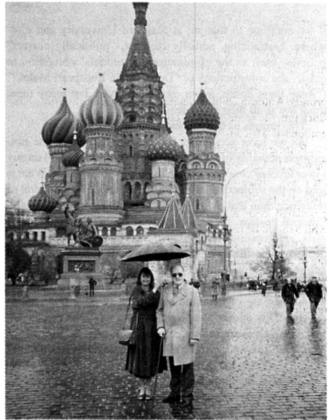
Lyndon and Helga LaRouche in Red Square, Moscow, April 1994.

We come thus to the concluding proposition: How might a literate policy toward Russia today, be crafted by today's, predominantly, functionally illiterate U.S. statesmen? Such a warning points toward the kind of men and women in public life, who, with guidance of pollsters, might have learned to identify the relatively more fashionable opinions of today, but who are either incapable of formulating actual conceptions, or, if they were capable of doing so, do not permit