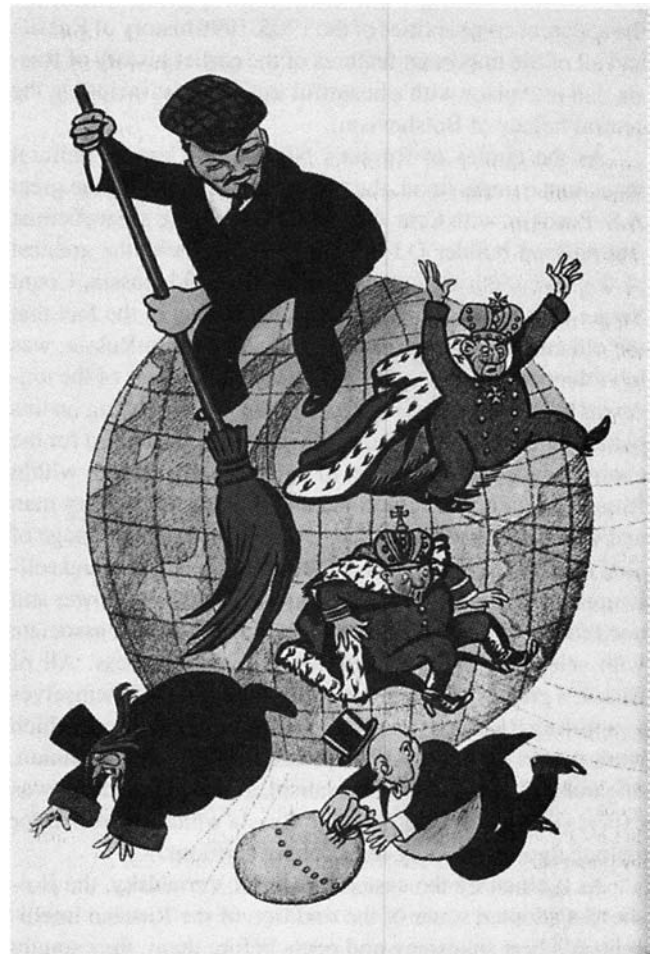
A Communist Party poster shows Lenin sweeping away the old order. Writes LaRouche: "Foolish Nicholas II's Russia hung out the sign for the ice-man: Who would bury the corrupt institutions which had combined their influence, to cause 1914-1917 Russia to destroy itself, by the folly of Russia's pan-Slav alliance with the Anglo-French war-makers? Lenin served as the undertaker."

it from dismemberment earlier. Those patriots would insist that the tale be told fairly, that it be granted, that there were certain achievements, some of heroic dimensions. These patriots would demand, that we tell them, "There must have been flaws, but certainly no worse than those of the rotten institutions of Nicholas II's time. Let us agree to settle these debts to history honorably; what were those flaws, that we might now proceed forward in history, without repeating the errors which brought about the self-destruction of regimes of the past?"