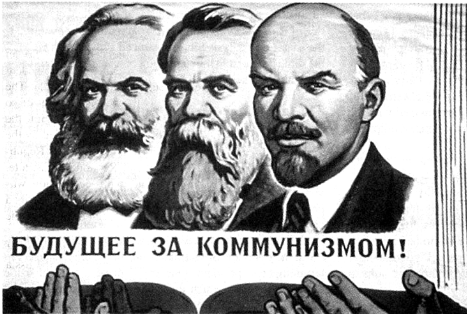
A Soviet poster showing Marx, Engels, and Lenin. The slogan reads, "The Future Is with Communism." LaRouche writes, "The crucial problem of internal political security confronting the Communists, in particular, was that the Communist and related movements were virtually all products of the so-called Enlightenment."

person's loyalty lie? To whom, is one attached; to what, is one committed?