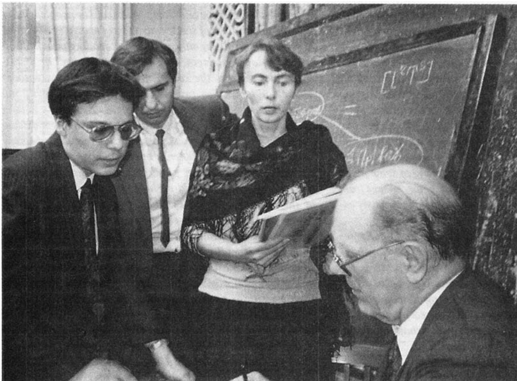
Lyndon LaRouche speaks with people attending his lecture at the Russian Academy of Sciences in Moscow, April 28, 1994. LaRouche's discussions with Russians in recent years, he writes, "have centered around the problems generated by the fact, that, for well-known historical reasons, few of even today's ostensibly well-educated Russians, know the most crucial facts respecting the last three centuries of the history of their nation's relationship to Venice, the British Empire, western continental Europe, and the United States."