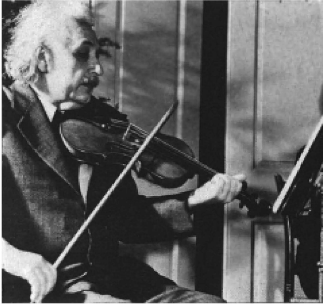
Albert Einstein. "Dry-as-dust mathematical minds dream in black and white; able Classical musicians prefer to dream in color, as do great scientists who prefer Classical music."

as the Venetian bankers who created the New Dark Age of Europe's Fourteenth Century.