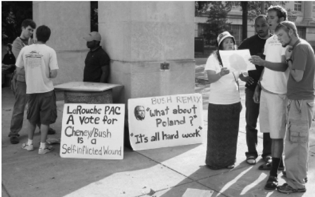
LaRouche youth organizing in Ohio to get Kerry elected, and stop a U.S. forced march into fascism under a second Bush Administration. LaRouche spoke to the youths' cadre school, which met in the Toledo area on Oct. 9.

Kepler, as I've said, based his notion of gravitation as a universal principle, on three empirical considerations: First, the planetary orbits—Mars, Earth—are elliptical, or not circular. That eliminates Aristotle; that is the error in the work of Tycho Brahe, and the error of Copernicus. There's another error of Copernicus, but that typifies the error.