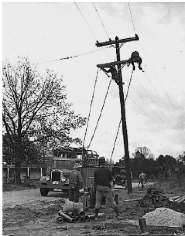
Franklin Roosevelt's Rural Electrification Act had incomparable effects on the productivity of U.S. agriculture. This shows electrical wire being strung in rural areas where the TVA was producing power.

You also observe an anomaly: You're sitting in Detroit, sitting the Ohio-Michigan area, and these are areas which are noted for their industrial development. But, if you look more closely at industrial development, you find it was not so much the large corporations like the General Motors, and so forth (Ford at an early stage was a better example), but the large corporations were not the ones who created productivity. These corporations depended for their productivity, on smaller firms. The vendors, the suppliers, the small machine-tool plants. You look throughout the state of Ohio, look at Michigan, the adjoining states: Look at the lost machine-tool, small, entrepreneurial machine-tool industries, or semi-corporate—you know, this hybrid in between the public corporation and the independent, privately con-