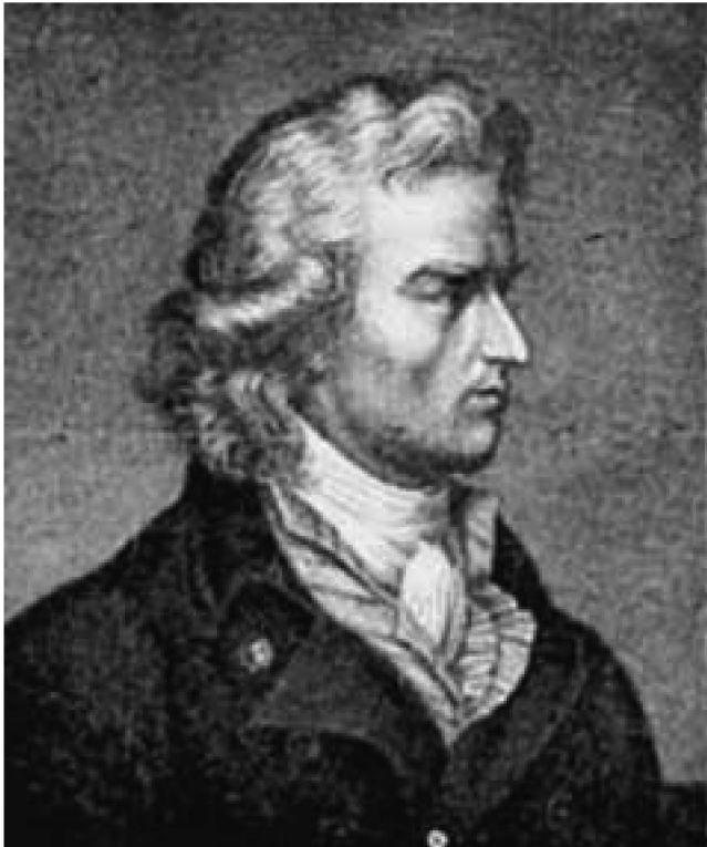
Friedrich Schiller, the “poet of freedom,” based his famous Classical tragedies on the human quality of the Sublime. “The same kind of notion of the Sublime applies to social processes, as the discovery of the principle of the modern nation-state republic, as defined during the Fifteenth Century, provided the needed escape from those imperial traditions of Rome and its successors which condemned the great mass of humanity to the status of human cattle.”