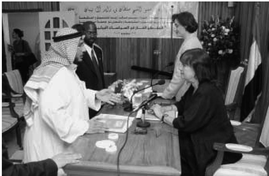
Helga Zepp-LaRouche, and a conference participant at the Zayed Centre, discuss the analysis of the economic and strategic crisis reported in EIR.

LaRouche: There would be no rational reason for the United States to consider doing that. That doesn't mean it wouldn't happen. We have, in Washington, many things that have happened recently, which no sane President would wish to do. We have an out-of-control situation. Remember, . . . this has to be taken into account. The United