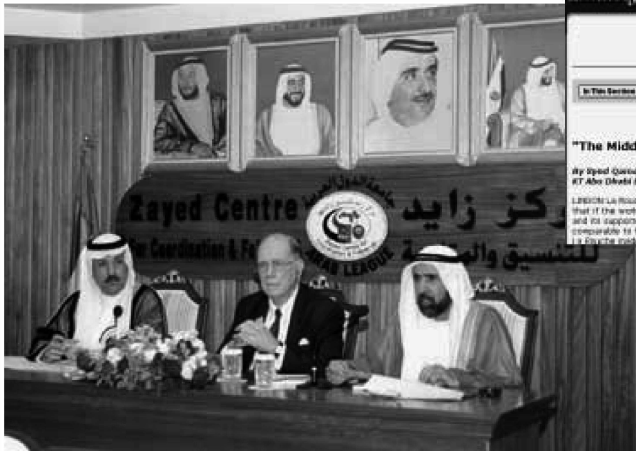
Lyndon LaRouche speaking June 1 to the Zayed Centre for Coordination and Follow-Up in Abu Dhabi, at the opening of the Centre's two-day conference. On LaRouche's right is U.A.E. Oil Minister Obeid Bin Saif Al-Nasseri, and on his left, former Iraqi Oil Minister Essam Abdul-Aziz Al-Galabi. Inset: an Abu Dhabi newspaper reports LaRouche's view on its website.

case, we shall see the implicit strategic potential of the Middle East as the crossroads of Eurasia. Any long-range forecast of the prospects of Middle East petroleum must be studied in the context of that challenge.