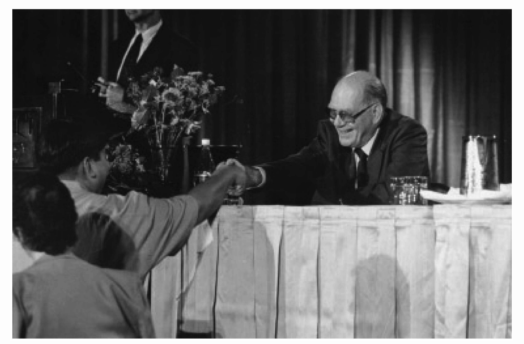
Lyndon LaRouche greets young supporters. "The task before us, a task on whose outcome the continued existence of our republic may depend absolutely, is the rapid recruitment of young people, and others, to emerge, soon, as true leaders. That is the purpose of this appeal on behalf of the cause of true freedom."

the universe. This benefit occurs, as it could occur only among human beings, through the transmission, through replication, of such individual acts of discovery, from preceding generations, to the present and future of society. Such discoveries of principle have a quality of impact upon human existence, which only genetic change to a higher species could mimic in the animal kingdom.