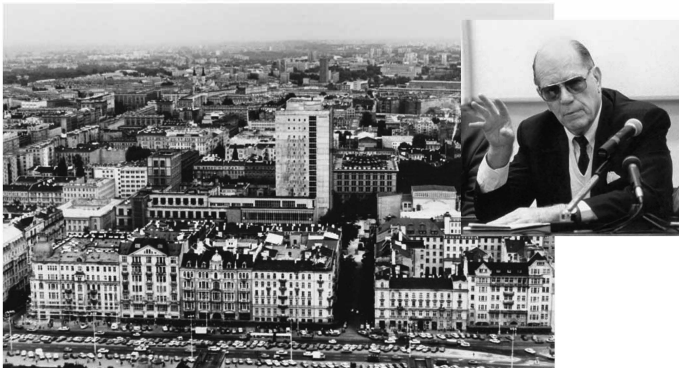
City center buildings and Cathedral of Warsaw in 1989, when Poland was breaking free of Communist rule and had not yet come under the IMF's disastrous economic dictate. In that year, Lyndon LaRouche (inset, speaking in Warsaw) first proposed East European reconstruction led by extending high-speed rail, energy, and communications corridors through Warsaw—the beginning of LaRouche's "Eurasian Land-Bridge" development concept. The Polish Schiller Institute has grown from the first discussions of that concept in Poland.

reichsmark, the German government, printing reichsmarks, to pay the debt, did not immediately show as an inflation in domestic German prices. But what was being done by the German government, was similar to what's being done by the U.S., and Japanese, and other governments today. They were printing money, to try to roll over an existing amount of debt. As a result, the debt grew. Therefore, the amount of money that had to be printed, to roll over the debt, grew.