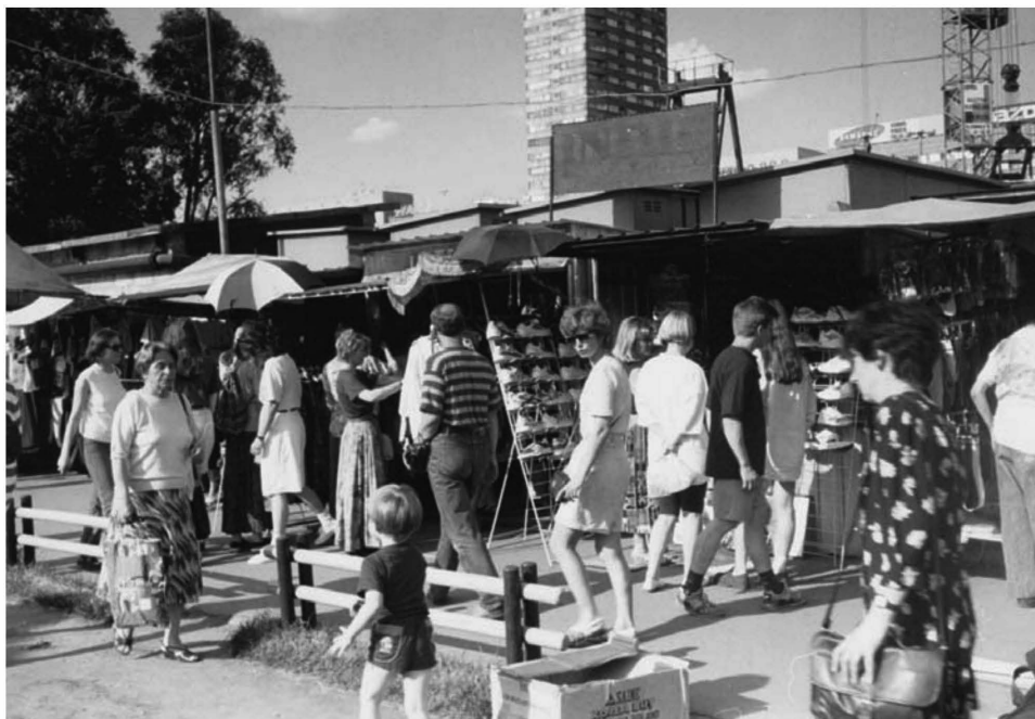
Instead of development of the real economy, Poles got the IMF's "my money" economy instead, reflected in a brief "consumer boom" for a small segment of society during the 1990s. "Free market" meant flea market, as here in the Warsaw city center in 1995.

history on the other side, in East Asia and South Asia.