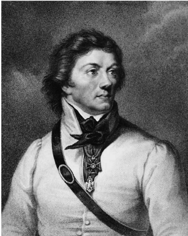
Keep fighting until we win “is an old Polish custom. That’s why Poland exists.” Thaddeus Kosciuszko, the most world-famed of Polish national liberation fighters, led the uprising of 1794 against Russian rule, and was a key collaborator of Gen. George Washington in winning the American revolution.

which is not exactly fruitful for human habitation, including Central Asia, and even the tundra areas of North Asia, will become areas in which the natural resources which lie in those areas, would now become economically accessible to the nations as a whole.