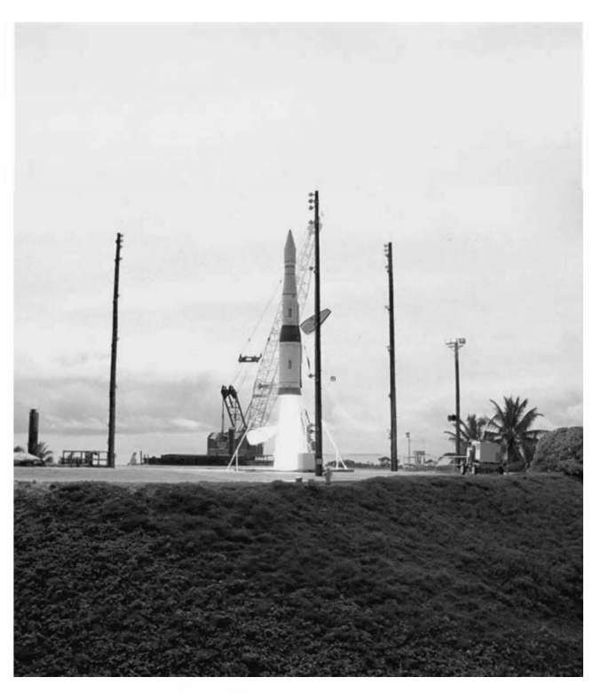
Already in the 1980s the U.S. rocket-interceptor tests were achieving similar results to those they exhibit now—here, a recent U.S. Army test of an experimental interceptor. These technologies, long off-the-shelf, do not offer what is needed, as the Patriot missiles' poor performance in Desert Storm demonstrated.

12. See EIR , Feb. 16, 2001, p. 48, for a report on Kissinger's Wehrkunde Conference claims about Bush administration intentions for national missile defense programs.