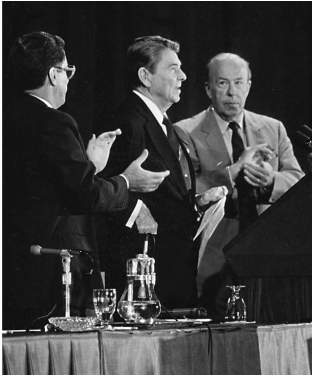
Step 3: The Reagan-Bush Administration ushers in the era of junk bonds and financial derivatives speculation.