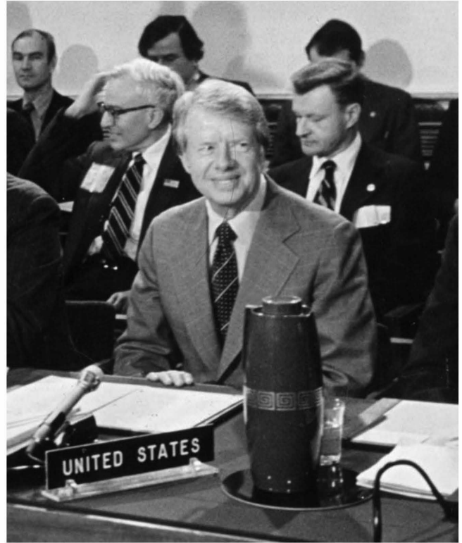
Step 2: Zbigniew Brzezinski's choice for President, Jimmy Carter, wreaks havoc with the U.S. economy. Here, Carter with members of his Cabinet, including Brzezinski (behind Carter, to his left).

of that, combined with Kissinger's orchestration of such developments as the 1973 Middle East war, unleashed a terrible ruin within the U.S. economy.