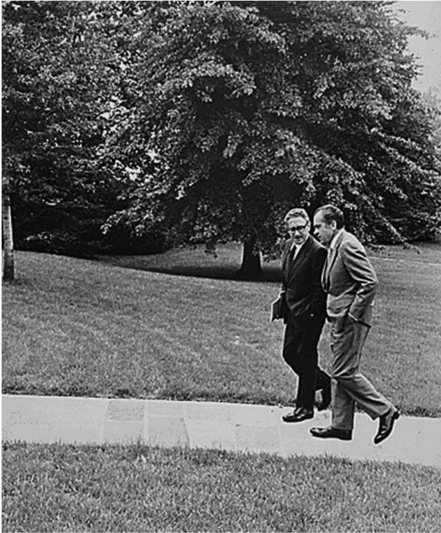
The first step into Hell: President Nixon's shift toward the "Southern Strategy," which led to the collapse of the Bretton Woods agreements in August 1971. Here: Henry Kissinger with the President, 1971.