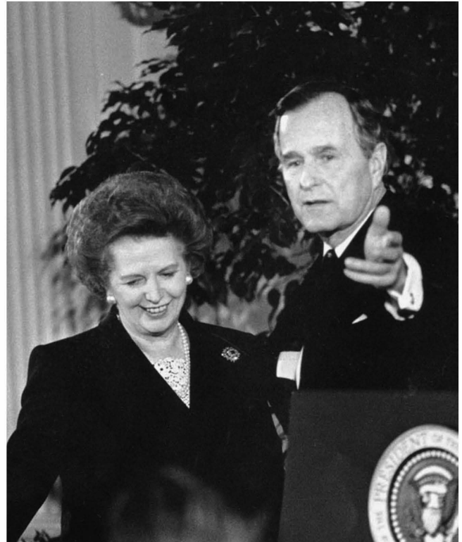
Step 4: Margaret Thatcher and George Bush, along with France's François Mitterrand, set into motion the policy known as "globalization," to destroy the world's nation-states.

the advent of January 1, 2000, would cause a chain-reaction financial collapse.