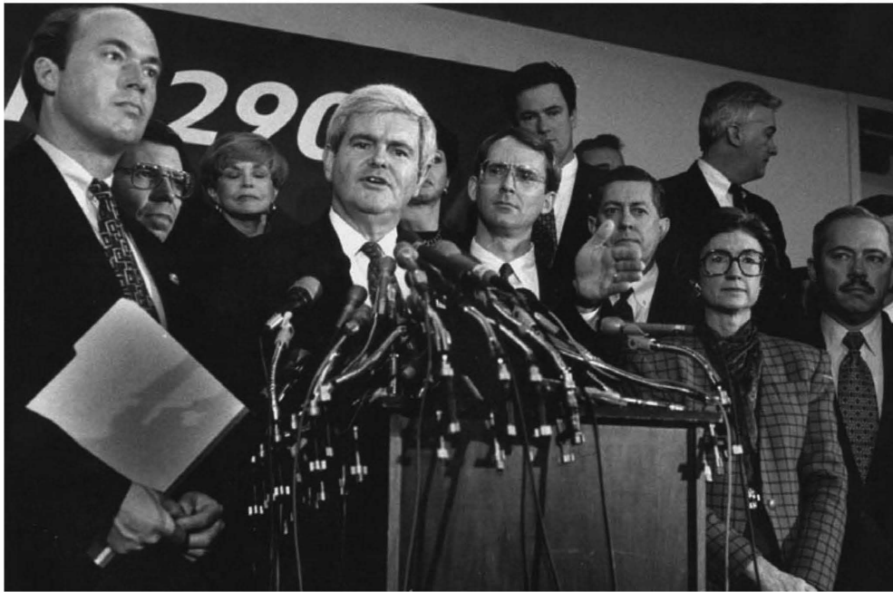
Former House Speaker Newt Gingrich and some among his Conservative Revolutionaries. The Republican "Southern Strategy" was an appeal to the "fundamentalist" bigots who brought Nixon and Kissinger into the White House, and began the process of wrecking the economy and morals of the U.S.A.

lateral Commission lackey and Zbigniew Brzezinski confederate Samuel P. Huntington, a perspective set forth by Huntington under the Carter-era rubric of a so-called "crisis of democracy." Thus, Project Democracy, better named "Project Lying Demagogy," was installed as the authority over both leading political parties, in 1982.