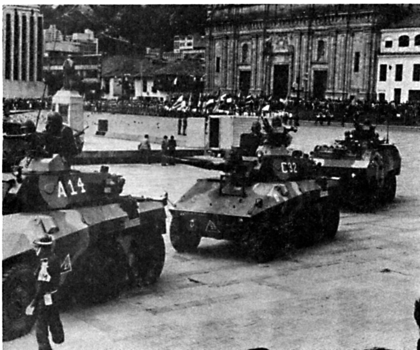
Colombian tanks guard the central square in Bogotá.

c) Under the Common Command, there should be established a central anti-drug intelligence agency, operating in