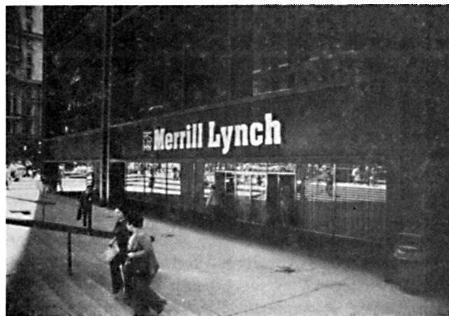
Merrill Lynch in New York City, one of the financial centers caught laundering drug money.