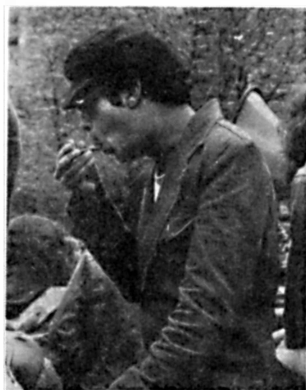
Any person purchasing narcotics or advocating their legalization, is guilty of the crime of giving aid and comfort to the enemy.