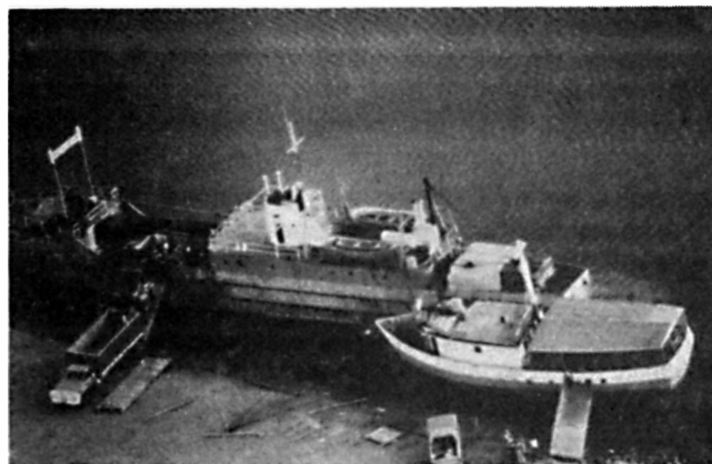
Drug traffickers loading their cargo aboard ships for export.