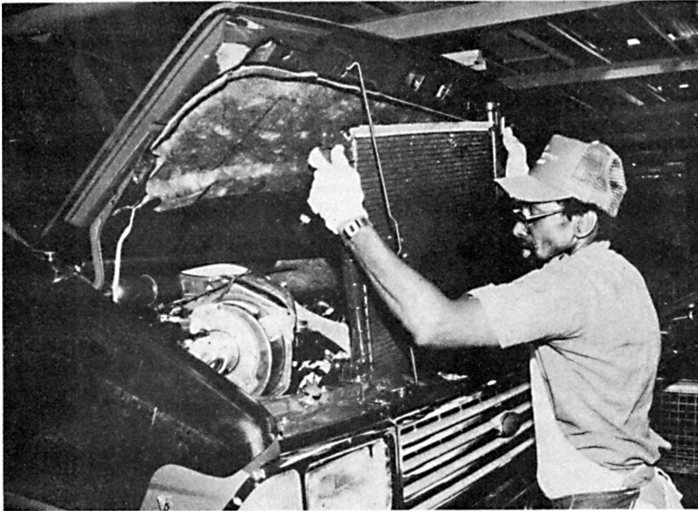
To construct an automobile that will last, engineers will have to stop planning obsolescence into the automobile's design, as has been the trend in the U.S. auto industry for decades. Shown is Ford Motor Company's St. Louis assembly plant.

making a technological leap ahead of foreign nations. Already, Japan and Germany are engaged in developing the ceramics industry, whereas the United States has been stagnating in this field. We must rebuild our primary metals capacity, anyway, so why not take the long-range view, and concentrate on the newest technologies?