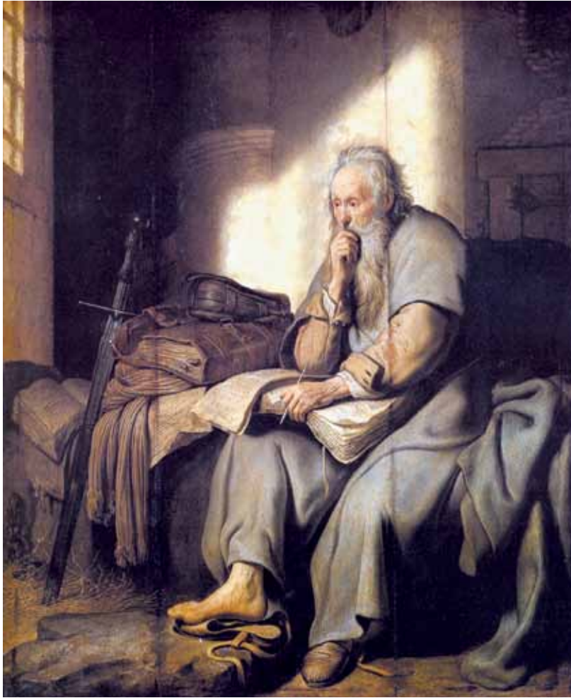
"It is the time to really begin to think!" "St. Paul in Prison," Rembrandt, 1627.

ated pack of both slick Wall Street and foreign swindlers operating in that light.