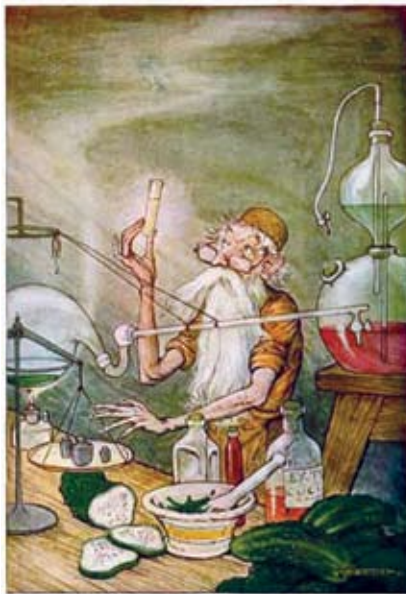
Milo Winter (1936)

I proceed here from that point of reference, with the following approach to treating a relevant, widely accepted, but viciously mistaken form of current popular opinion. I mean the fraudulent opinion met even among a lately increasing ration of the incompetents from among those who have been treated mistakenly as if they were authorities, as in the matter of certain important errors which have been mistakenly touted as representing competent opinion, even that by some govern-