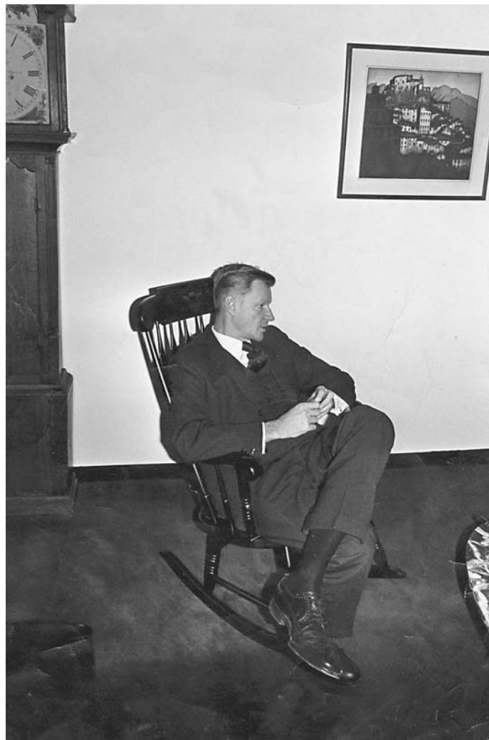
Zbigniew Brzezinski. Writes LaRouche: “ ‘Zbiggy,’ as he is called, is the deceptively goofy thug some Washington regulars of President Carter years used to refer to as ‘Woody Woodpecker.’ He was never of much use for winning wars; but, to the present day, he remains, like Kissinger, a person of those Hobbesian compulsions which dedicate him to provoking them.”

The H.G. Wells-style scenario implied by Zbiggy’s The Grand Chessboard , defines Central Asia as the likely cockpit from which the war could, and, according to the utopian madness of his “shape of things to come,” should spread to wide areas of the world.