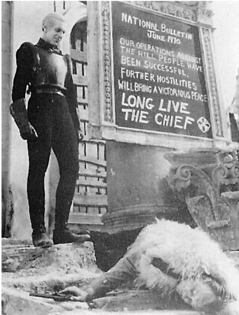
A scene from the film "Things to Come," based on H.G. Wells's book The Shape of Things to Come . Brzezinski defines Central Asia as the likely cockpit from which war could spread to wide areas of the world, along the lines of Wells's utopian scenario.

racY" is "billions of decisions" embedded within the actions of predators in unregulated financial "markets," such as those "decisions" represented by the raids on Malaysia by international predator George Soros. Similarly, Gore's definitions defend the looting of your pensions, health care, food supplies, and so on by similar predators' actions within financial "markets" as something to be upheld in the name of "democracy."