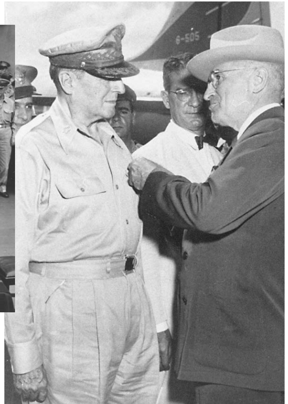
President Harry S Truman's baiting and firing of Gen. Douglas MacArthur directly misshaped virtually all U.S. strategic thinking since 1951. Left: Supreme Allied Commander MacArthur signs the document of Japan's surrender, Sept. 2, 1945. Right: President Truman gives MacArthur a Distinguished Service Medal, Oct. 14, 1950. Six months later, Truman fired him.

This is typical. In western Europe, as in the U.S.A., political power is presently concentrated under the control of a class of financial parasites, which find a substitute for both patriotism and even simple morality, in their lunatic personal instinct for financial speculator's greed. For them, it is the perpetuation of that larcenous power, even for another few weeks, which is everything. The people and the real economy of the nation mean nothing to those who are still ruling policy-shaping in the U.S.A., western Europe, Russia, and most other locales.