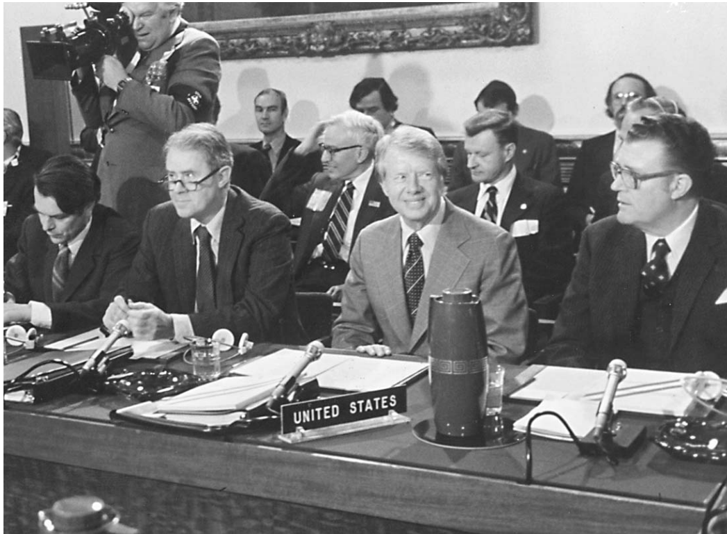
Wall Street puppet President Jimmy Carter, with entourage of Trilateral Commissioners including Cyrus Vance (to Carter's right) and Zbigniew Brzezinski (behind Carter's left shoulder). On the far left is Britain's David Owen.

were rumbles of what was to become the economically catastrophic Carter Period.