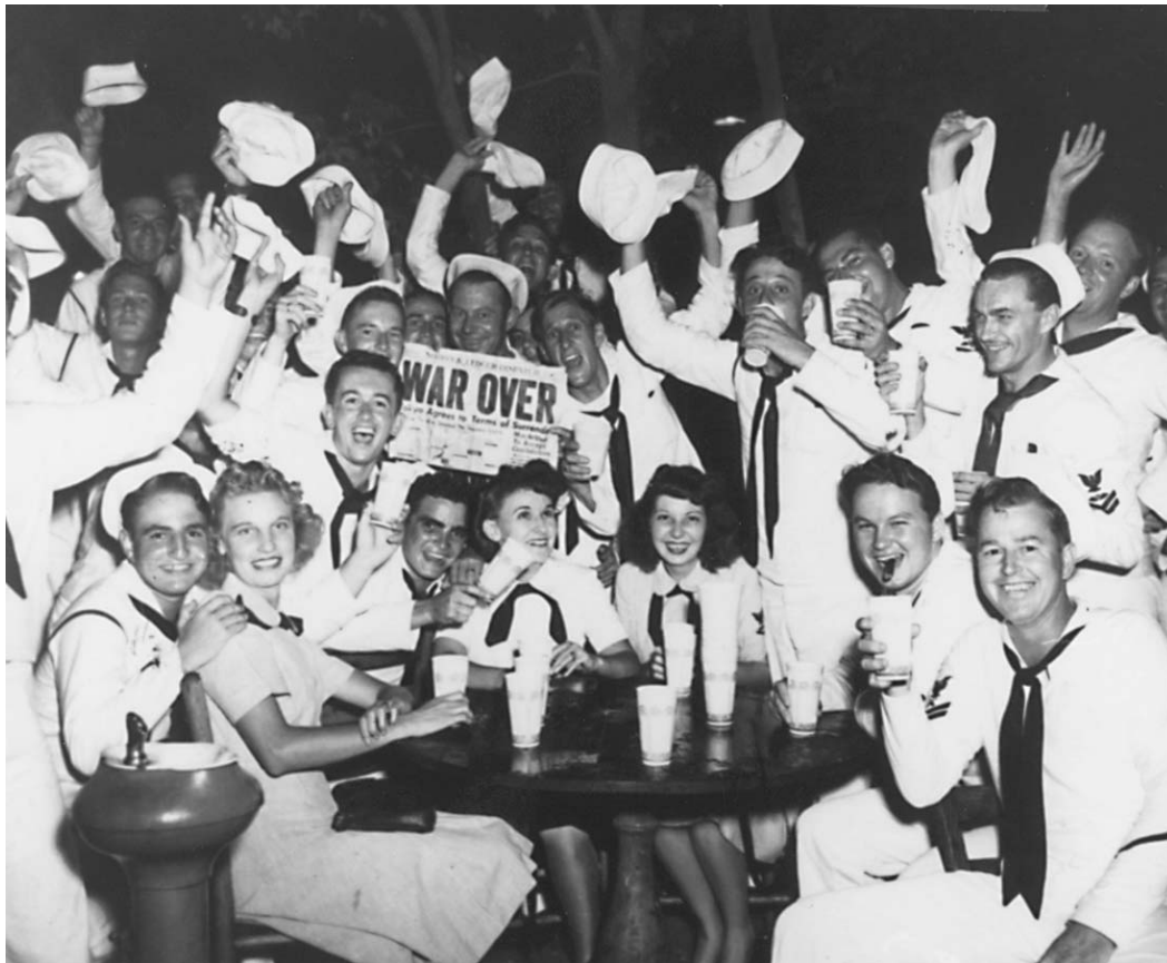
A victory celebration in Norfolk, Virginia, at the close of World War II. With the shift into the Truman era, the personal self-confidence and moral caliber of the returning American veterans shrank significantly. The mounting fear of return to the 1930s Great Depression, overlapping the rise of political witch-hunts, became, quickly, a tendency to withdraw from morality, into an attitude of "every man for himself."

mittedly, some people were still willing to risk death, and make other sacrifices, for a common purpose; however, this was rarely done out of a moral commitment, but out of a kind of conformism which should have reminded us of Propaganda Minister Josef Goebbels. To this day, most of the population of the U.S.A. has never fully recovered from the radiated impact of "Trumanism:" "keeping out of trouble with the authorities" usually outweighs any regard for truth and justice. "Let any ox be gored, as long as it is not my own."