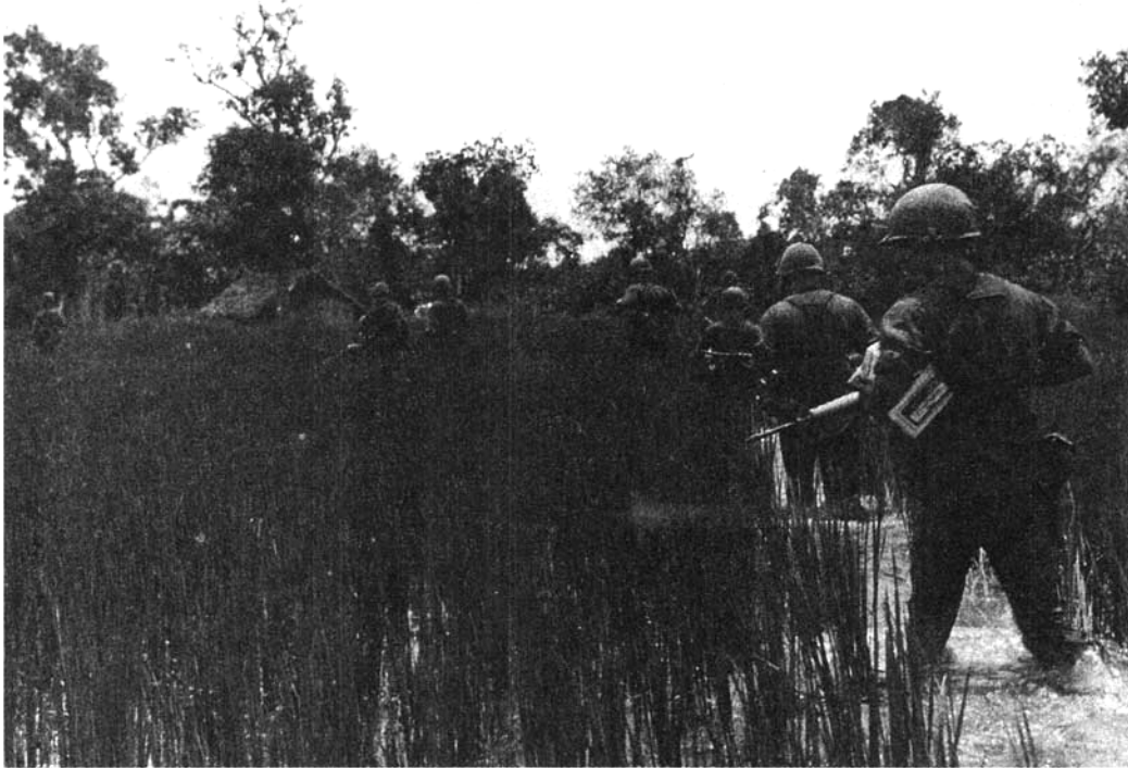
U.S. soldiers in Vietnam, September 1965. "Every night, on television, from the middle of the 1960s on," said Lyndon LaRouche, "you had battlefield pictures of American soldiers being shot to death, chopped to pieces, and so forth, on television. Under these conditions, what was induced in the United States (but not just the United States), was what was called a 'cultural paradigm shift.' "

thing that was done by the British faction in the United States was to collapse the mechanisms of economic growth in the United States, as a result of which, we had a recession from 1946 through 1948—very severe. It produced a politically dangerous demoralization among returning soldiers and their families. But from that point on, through to the present time, the United States has never had net economic growth, except in terms of mobilization for war, or for aerospace ventures. Every period of growth in the United States, since 1945, has depended upon the spillovers of military expenditures, or infrastructure development.