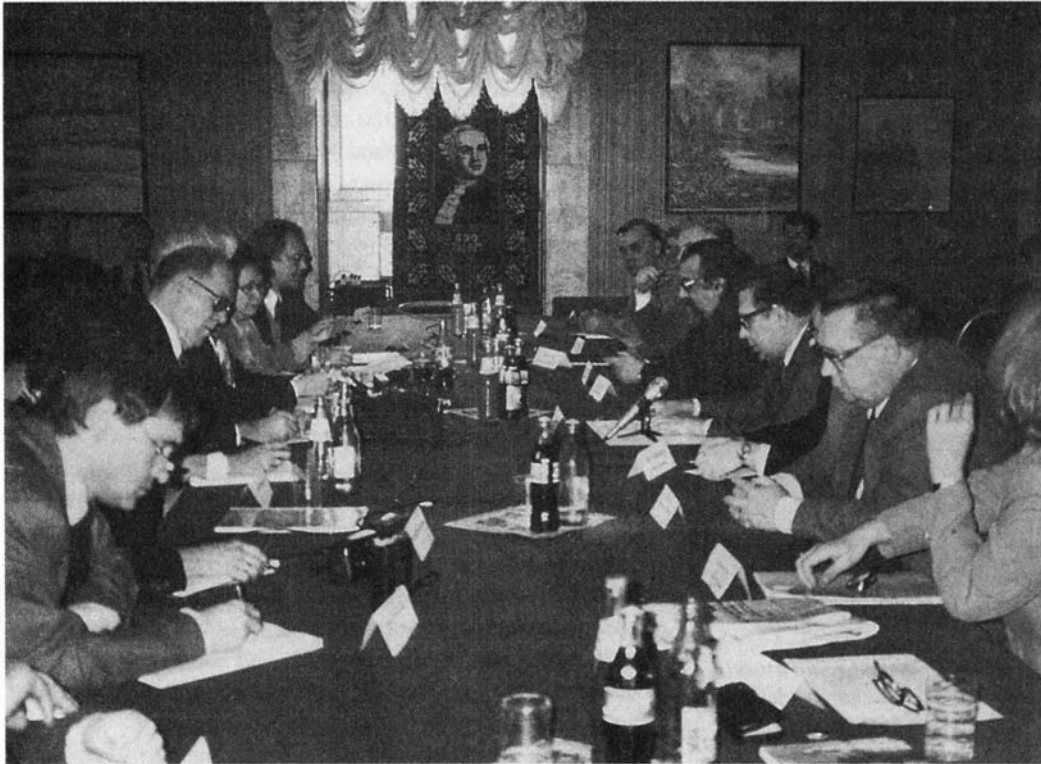
Lyndon LaRouche (third from left, with shaded glasses) participates in a round table with Russian economists and political figures, at the Free Economic Society in Moscow. The portrait at the rear of the room is of Mikhail Lomonosov, the greatest Russian scientist of the eighteenth century, who died in 1765, the year that the Free Economic Society was founded.

these discussions are included. We have a periodical journal and a newspaper, published jointly with the International Union of Economists, which also extensively cover our discussions, making them available to the public. On the basis of these discussions, we regularly prepare analytical reports and memoranda, which are submitted to the official authorities—the Presidential organizations, the government, and the State Duma.