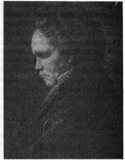
Left to right: Franz Schubert (1797-1828), Wolfgang Mozart (1756-1791), and Ludwig van Beethoven (1770-1827) each developed the proposition in Bach's Musical Offering , showing "the seamless union of scientific methods of musical composition and beauty."