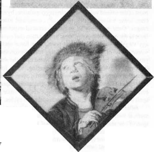
The orchestral and keyboard instruments, designed for a well-tempered scale pivoted upon C=256 , were developed in imitation of the characteristics of the bel canto voice-species. Pictured counterclockwise from above are moments in this history: angels singing polyphonic music (detail from a 15th-century Flemish painting); boy violinist (by the Dutch artist Frans Hals, early 17th century); man playing the newly invented type of flute (by Antoine Watteau, French, 18th century).