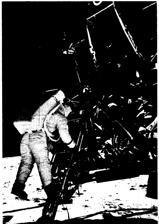
Astronaut Edwin Aldrin, Jr. leaving the Lunar Module to walk on the Moon during the 1969 Apollo mission.

This legacy informed the view of economic science developed by Leibniz. He established academies such as the university at Freiberg—where Alexander von Humboldt was educated, a center which greatly influenced the economic development of the United States and Japan, among other instances—and personally established also the university at